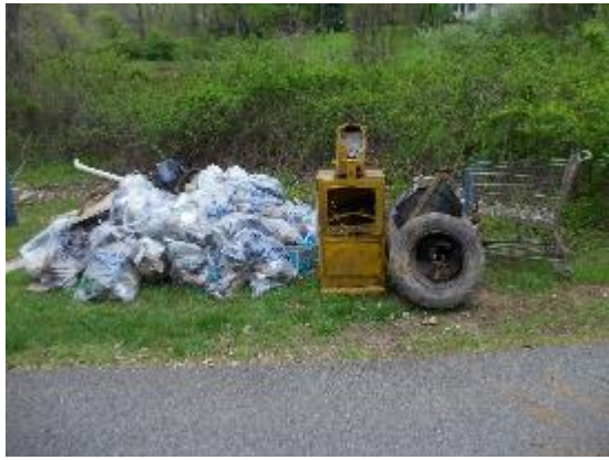
Figure 1: Trash collected during Plow & Hearth clean up during the previous day along the Reservoir.