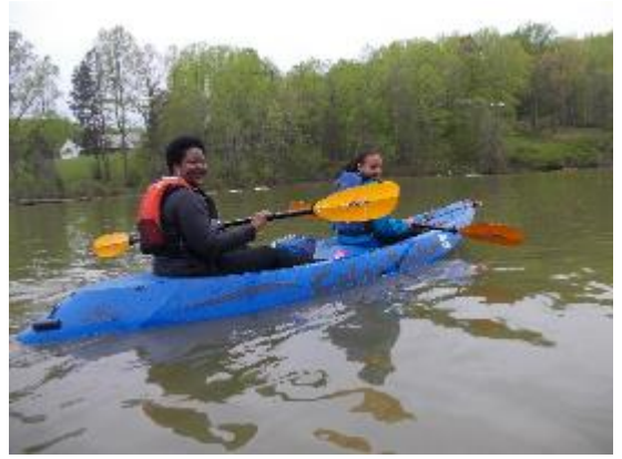
Figure 4: Having fun paddling a tandem kayak