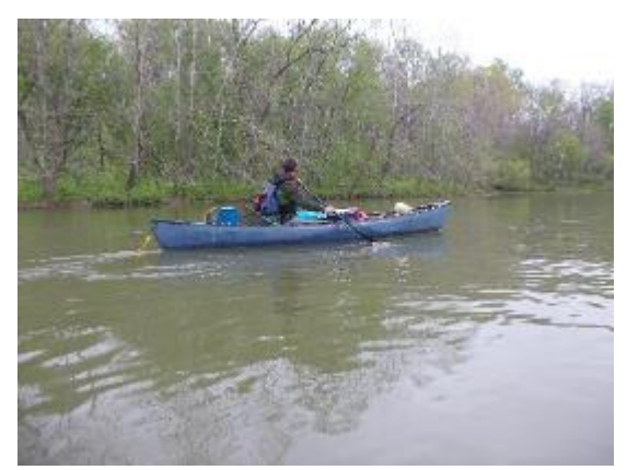
Figure 7: Hauling some of the trash we picked up