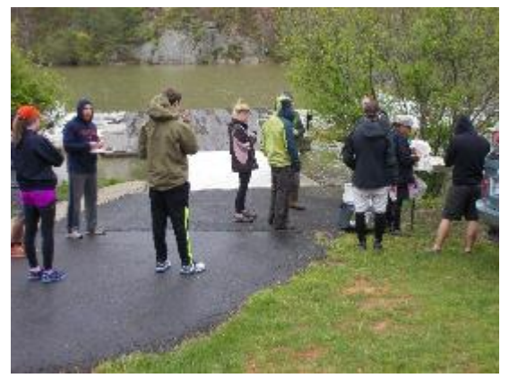
Figure 10: Everyone enjoying the food supplied by Walmart