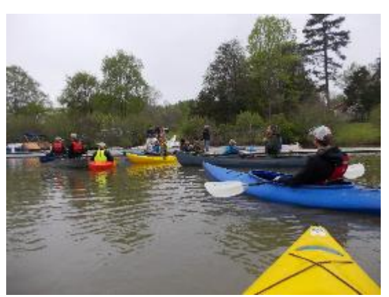
Figure 2: Getting ready to start the paddle at the boat dock