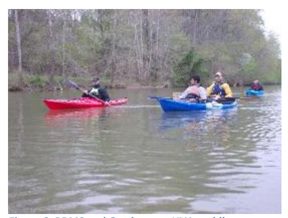
Figure 6: BRMS and Outdoors at UVA paddlers