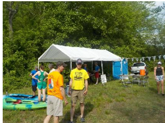
Figure 2: Registration and start setup