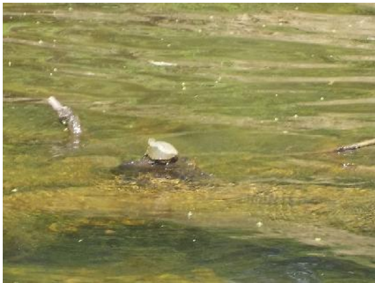
Figure 15: Turtle on a log sunning itself