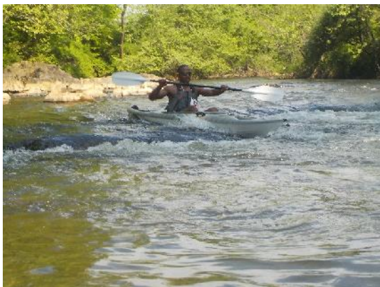
Figure 17: Another paddler going through the rapids