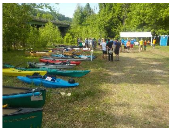
Figure 6: Boats lined up at the starting line