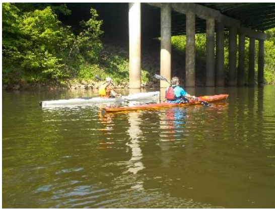
Figure 9: Paddlers warming up before the race