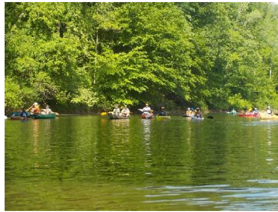
Figure 10: Waiting for the start of the race