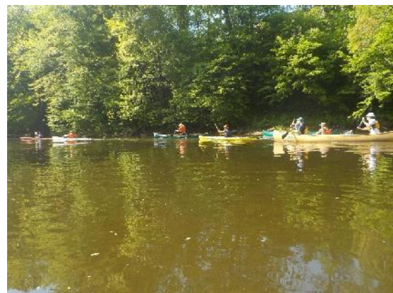
Figure 11: Paddlers on their way