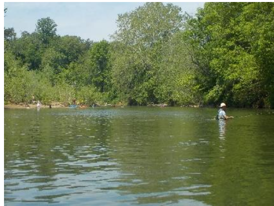
Figure 20: People enjoying the River near Darden Towe