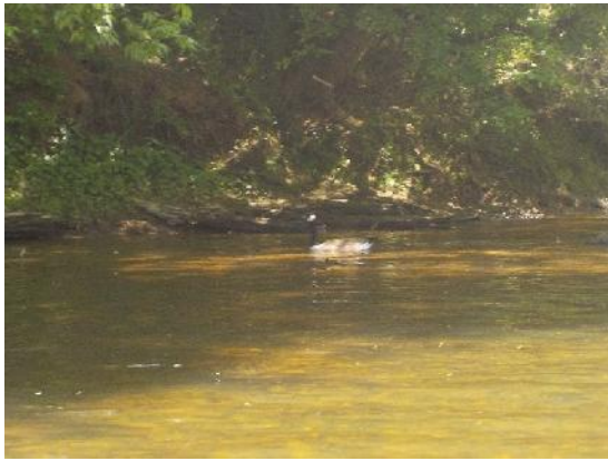
Figure 13: Goose floating in the river