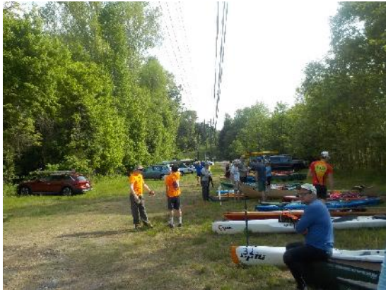
Figure 1: Starting location for the Regatta