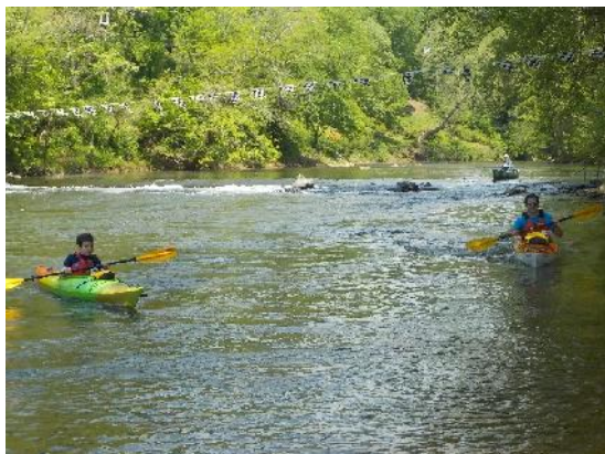
Figure 23: Father and son finishing the race