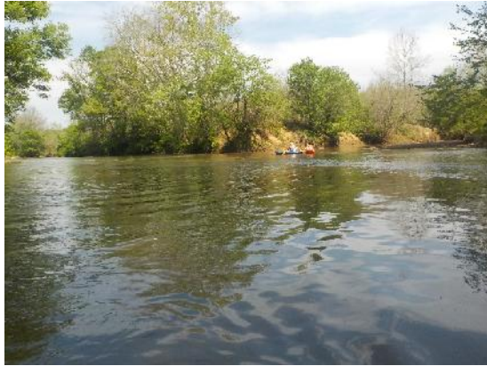
Figure 19: Confluence of North and South Forks