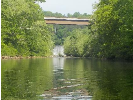
Figure 7: View of the Dam looking upstream