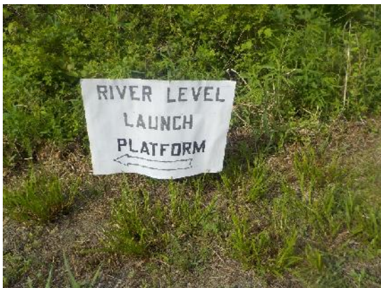
Figure 3: Put in signage