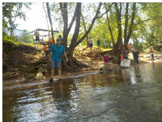
Figure 22: Arriving at Darden Towe to finish the paddle