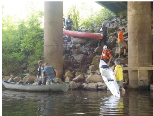
Figure 8: Getting the boats in the water at the start