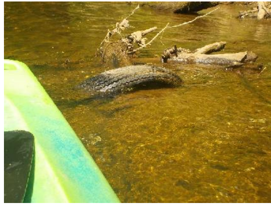
Figure 14: One of the tires spotted today