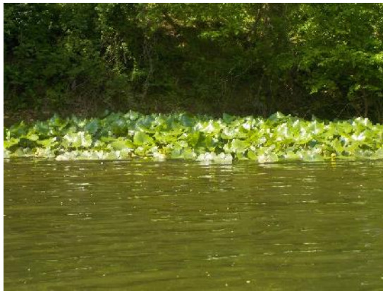
Figure 12: Vegetation in the river