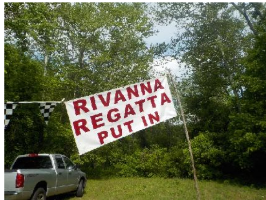
Figure 4: More put in signage