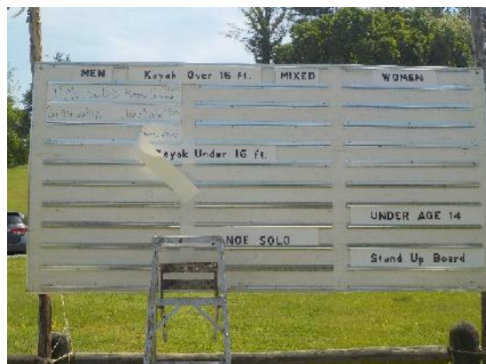
Figure 24: Board where race winners are displayed