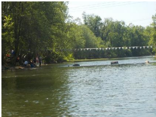
Figure 21: Finish line at Darden Towe boat ramp