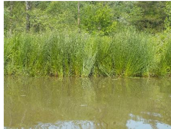
Figure 6: Grasses growing up out of the water