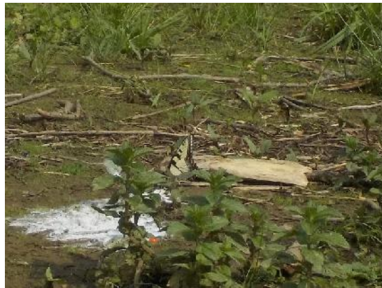
Figure 2: Butterflies near Reas Ford Rd