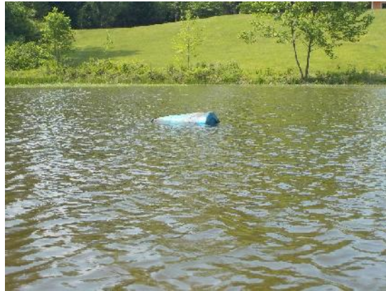
Figure 14: Blue drum floating in the Reservoir