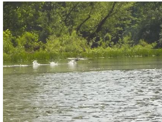
Figure 5: Same bird flying away