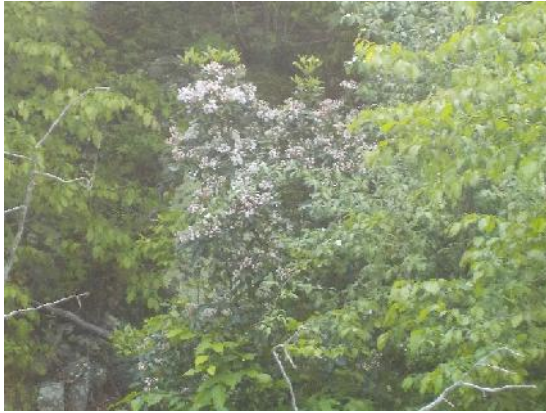
Figure 7: Flowering vegetation along the bank