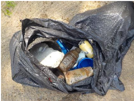
Figure 17: Some of the trash collected during the paddle