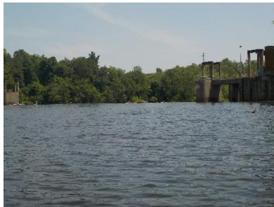
Figure 16: View of the dam