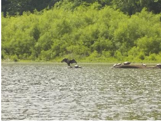
Figure 13: Aninga or Cormorant stretching its wings