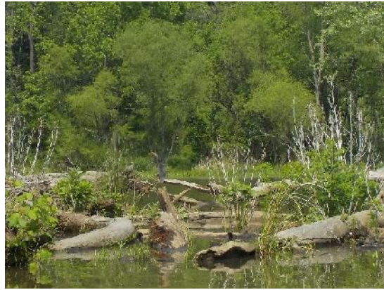
Figure 8: Another sighting of the Anhinga or Cormorant