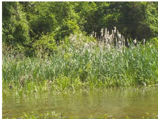
Figure 12: Cattails growing up out of the water