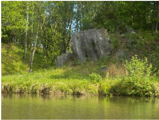
Figure 3: One of several interesting rock formations