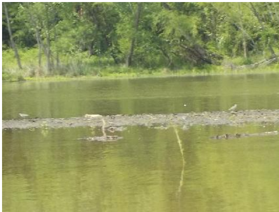
Figure 9: Sandpipers looking for food