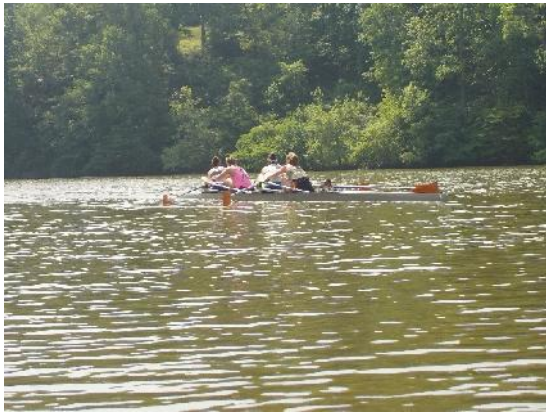
Figure 11: Rowing team out practicing