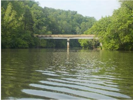
Figure 1: View of Reas Ford Rd bridge looking upstream