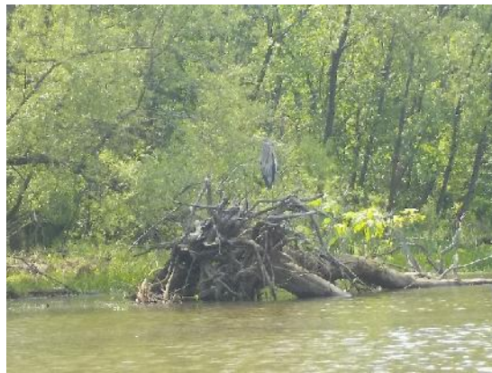
Figure 10: Blue Heron perched on a downed tree