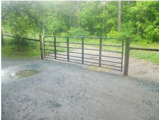
Figure 1: New gate / fence at Milton