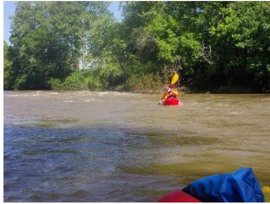
Figure 8: Jamie paddling through Union Mills rapids