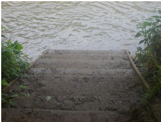
Figure 3: Milton boat access steps into the River