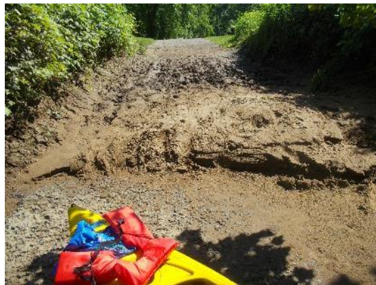
Figure 10: Sediment on Crofton boat ramp