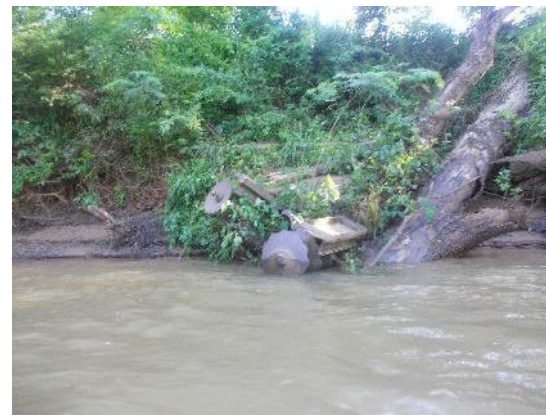
Figure 6: Large piece of farm equipment on the bank