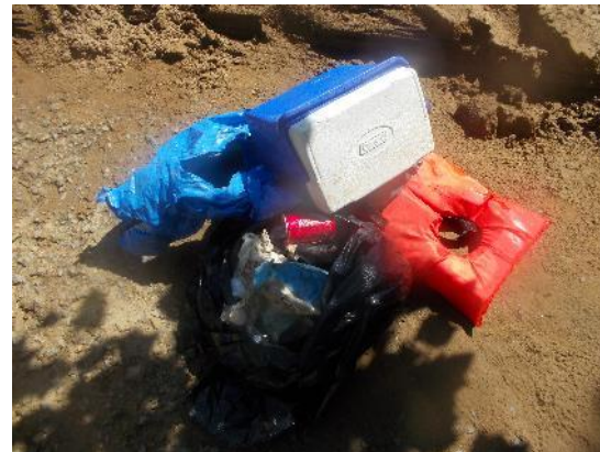
Figure 12: Trash collected during the paddle