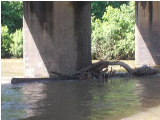
Figure 11: Trees piled up at Crofton bridge abutment