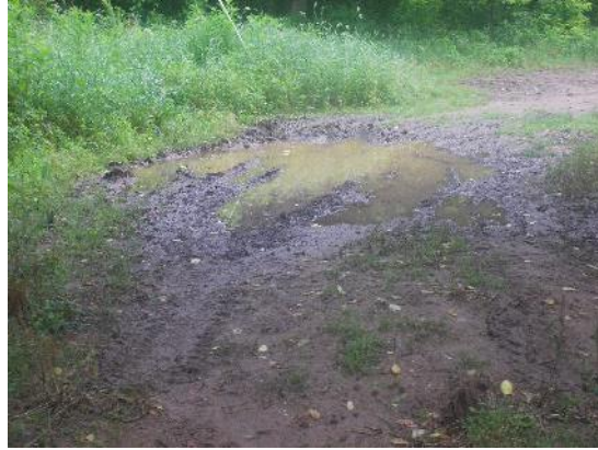
Figure 2: Dirt road at Milton boat access