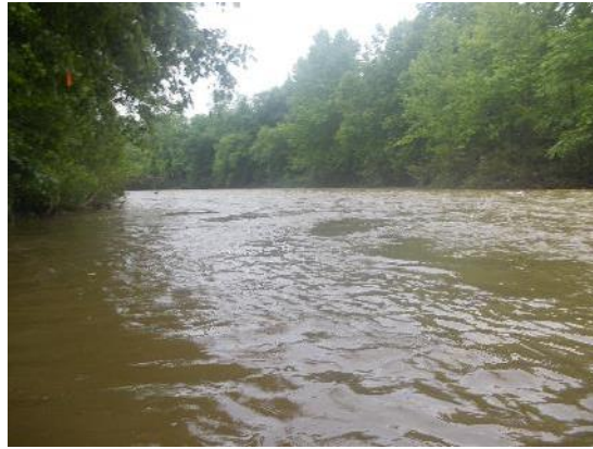
Figure 4: View of the Rivanna down river from Milton