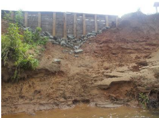
Figure 5: Erosion of bank at Glenmore