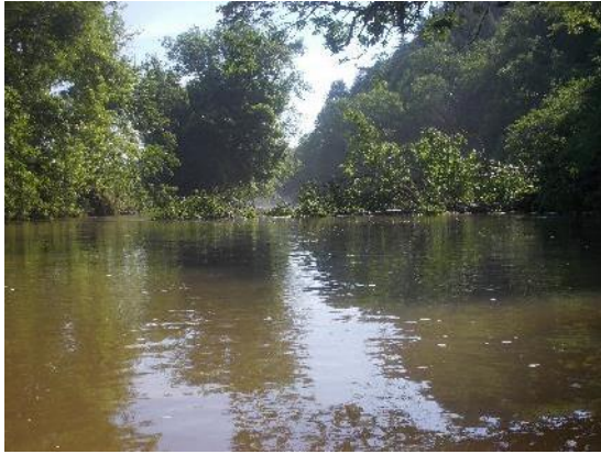
Figure 7: Tree down across the River