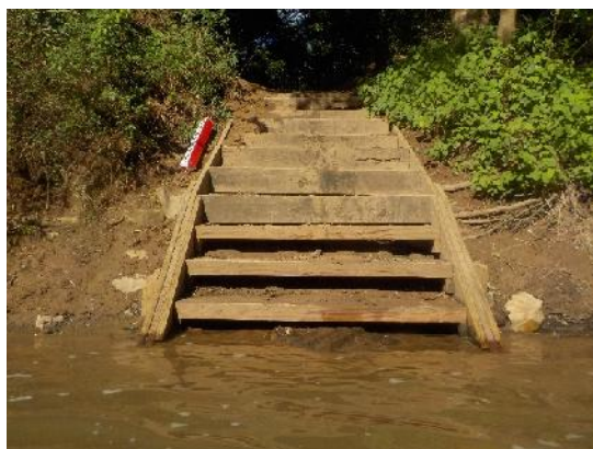
Figure 15: Milton boat ramp with downed sign