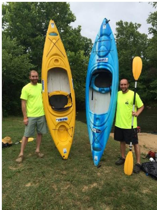
Figure 1: This is the yellow kayak (right side of photo) that was stolen from Darden Towe Park. Note the photo was taken several years ago, and is just included to give a visual of what the kayak looks like.

3 – Report stolen kayak in attempt to get it back; 3 – Retrieve the RCA Historic Panel from the River; 3 – Remove larger objects from the River; 3 – Organize tire removal event in the coming months; 3 – Rehang the sign on the orange flotation device at Milton boat ramp so everyone knows where to get off the river, since it is easy to miss.