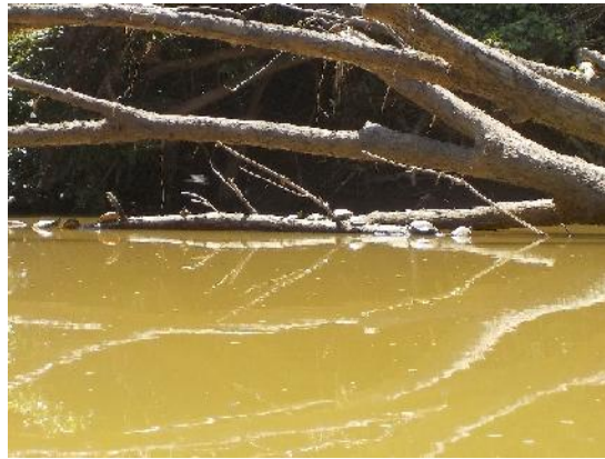
Figure 3: Lots of turtles out sunning themselves today