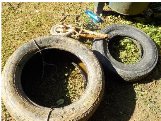
Figure 16: Tires and bicycle others removed from river