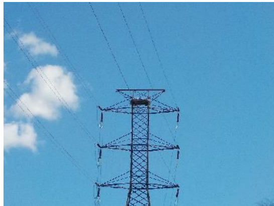
Figure 13: Eagle's nest up on top of power line tower