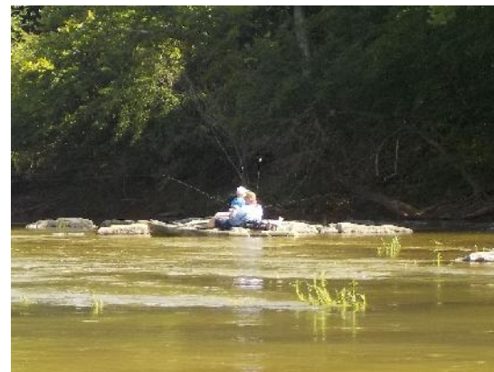
Figure 12: People fishing in kayaks