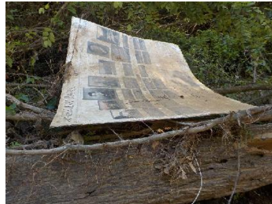
Figure 7: RCA Historic Panel from Kiosk that washed away