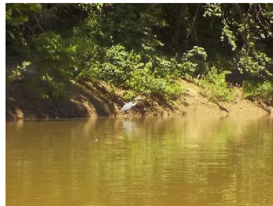
Figure 5: 1 st Blue Heron sighting of the day