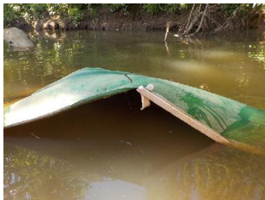
Figure 11: Large object in the River