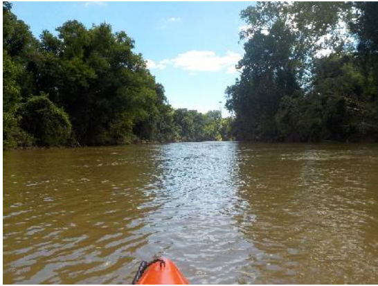
Figure 2: View of the Rivanna today looking downstream