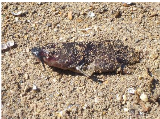
Figure 14: Dead catfish left on the bank