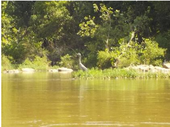
Figure 8: Another Blue Heron