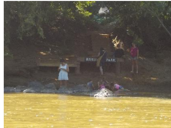
Figure 6: People enjoying the river at Riverview Park