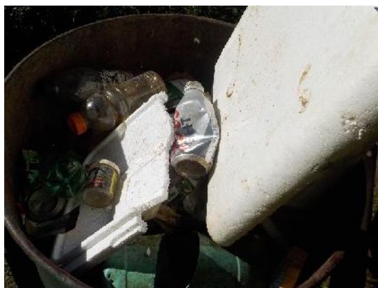
Figure 17: Smaller trash found during the paddle