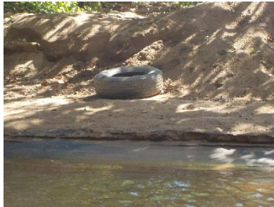
Figure 9: One of the tires found today