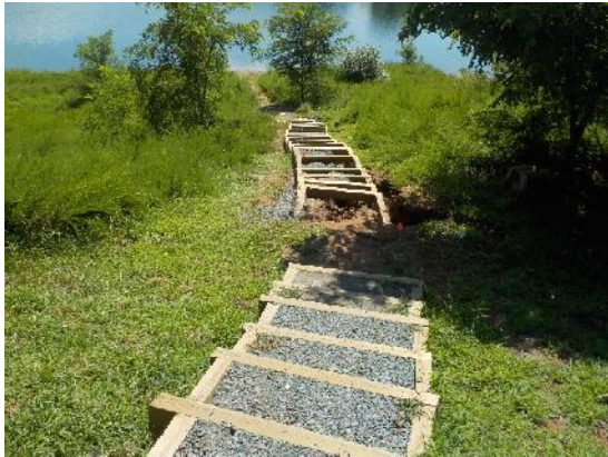
Figure 1: Newly installed stairs that are eroding