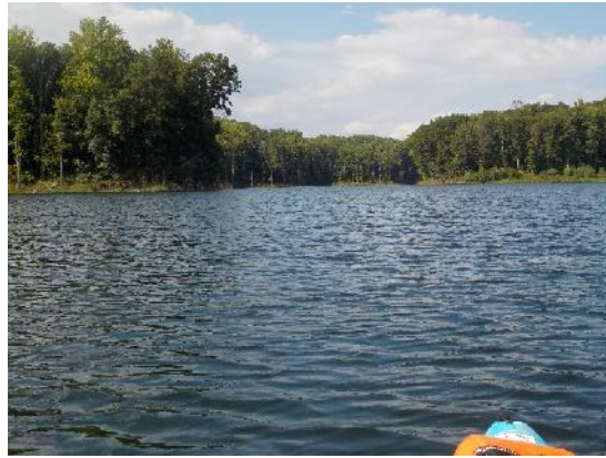
Figure 8: Another view of the Reservoir