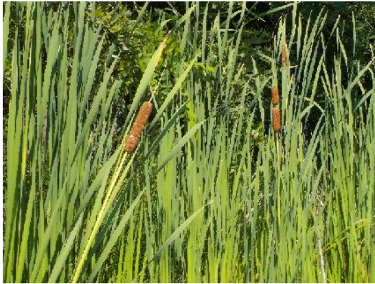
Figure 7: Cattails growing in the Reservoir