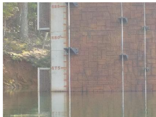
Figure 12: Water level reading for today