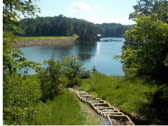
Figure 2: View of the Reservoir from above