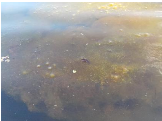
Figure 11: Another view of substance found in Reservoir