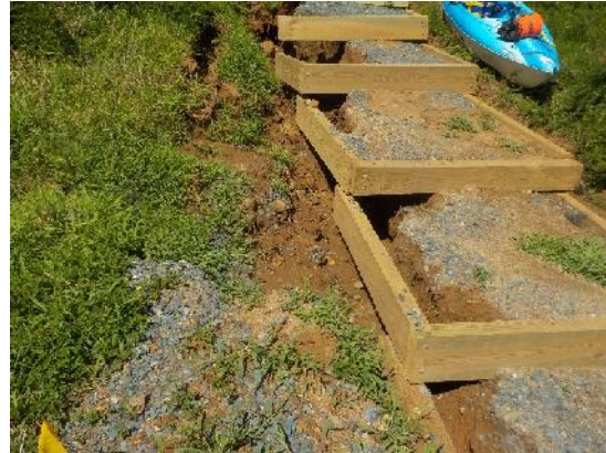
Figure 4: Another photo of the eroding stairs