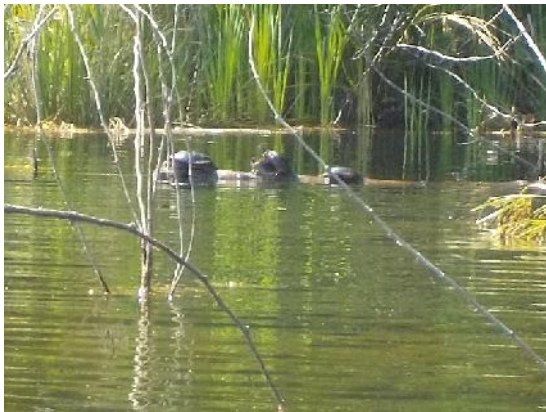
Figure 9: Small turtles resting on a log