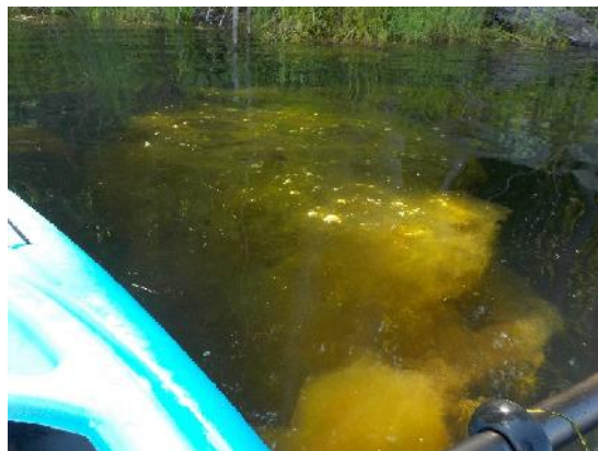
Figure 10: Bubbly gooey substance found in the Reservoir