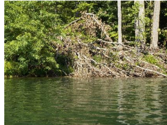
Figure 6: Large tree down at edge of Reservoir