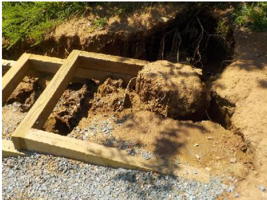
Figure 3: Some of the worst erosion on the stairs