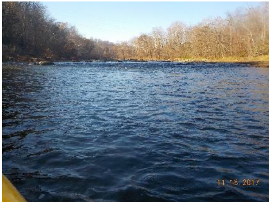
Figure 7: Area where trailer was buried before removal