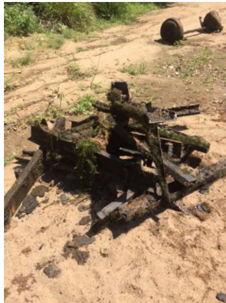
Figure 16: Trailer pieces after being cut up (Photo taken on August 31 st by Matt Ascoli)