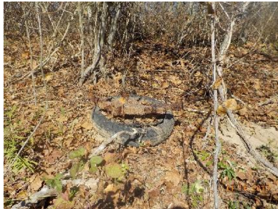
Figure 8: One of the two trailer wheel assemblies removed