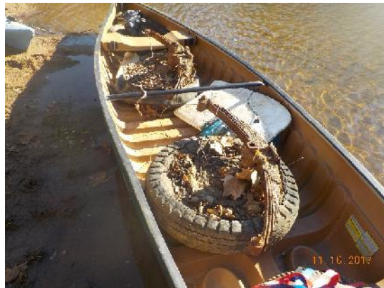
Figure 10: Canoe loaded up with trash