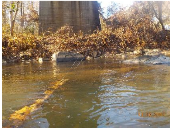
Figure 2: Another photo of downed power lines