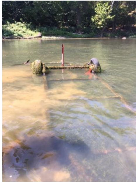
Figure 14: Trailer coming up out of the River