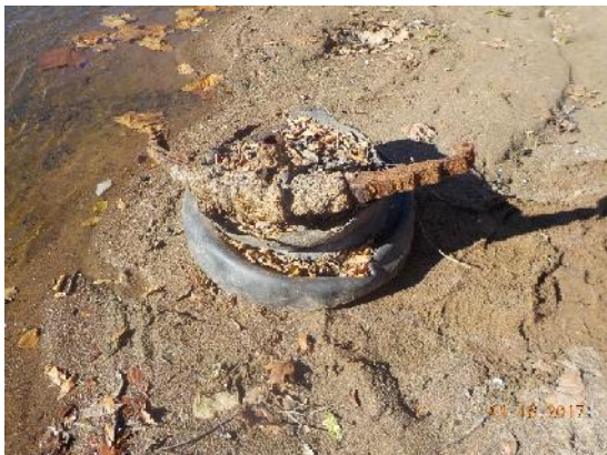
Figure 9: Second of the trailer wheel assemblies removed