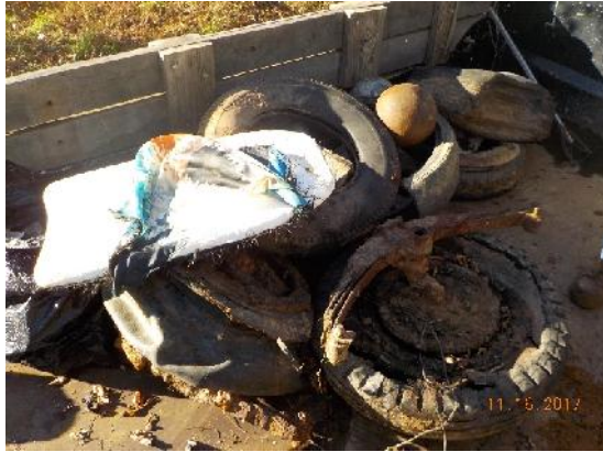
Figure 13: All the trash removed from the River today