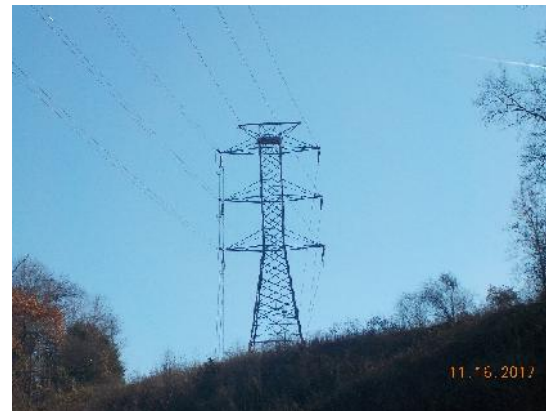
Figure 6: Eagle's nest on power line tower