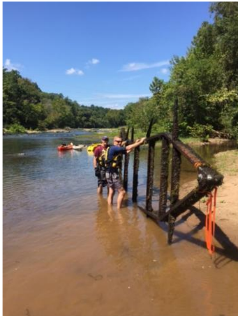
Figure 15: Trailer being removed from the River