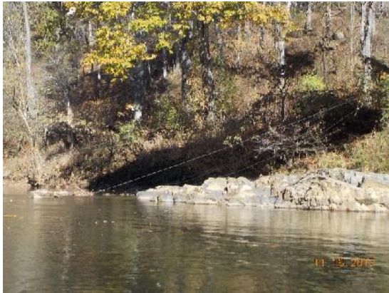
Figure 1: Downed power line in River at Railroad Bridge