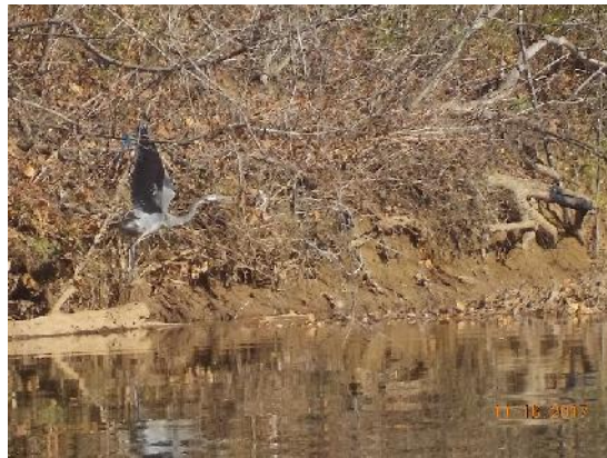
Figure 4: Heron taking flight