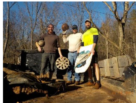
Figure 12: Showing off some of our finds today