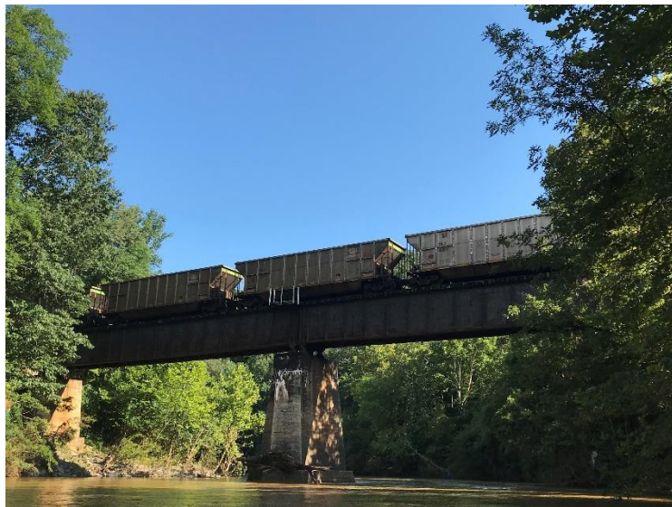
Figure 2: Train overpass bridge.