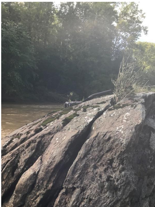
Figure 3: Anchor on rock that once attached to overhead bridge crossing River.