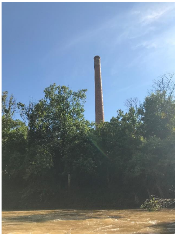
Figure 1: Old Woolen Mills site from River.