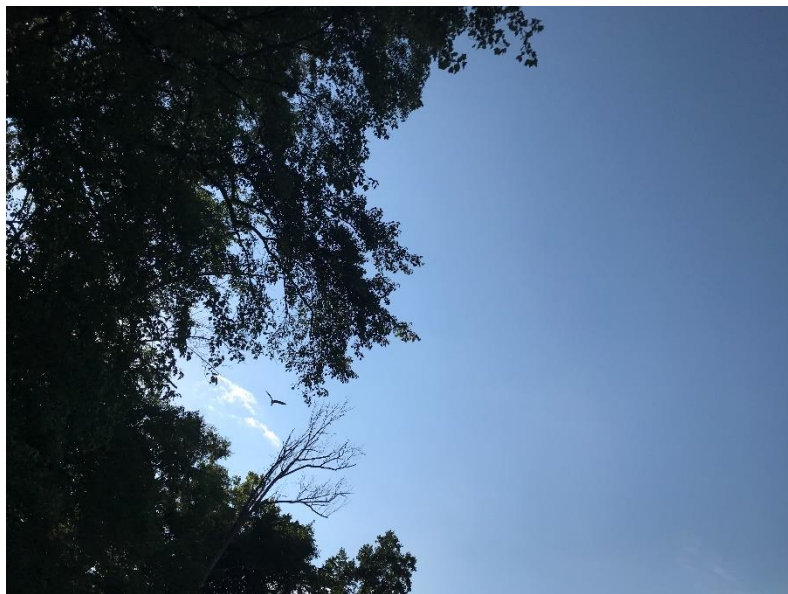
Figure 4: Osprey flying overhead.