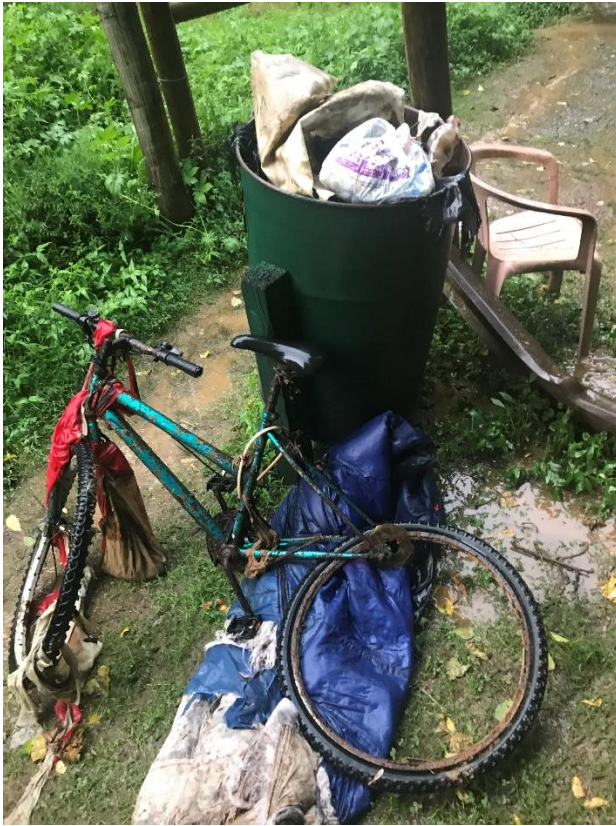
Figure 5: Trash/Debris removed from River.