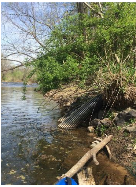
Figure 19: Pipes hanging into the River (GPS Coord: 38°05.701′N 78°26.697′W)