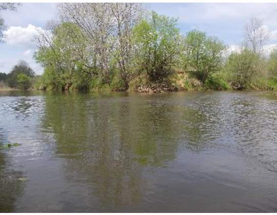
Figure 14: Confluence of South & North Forks looking upstream