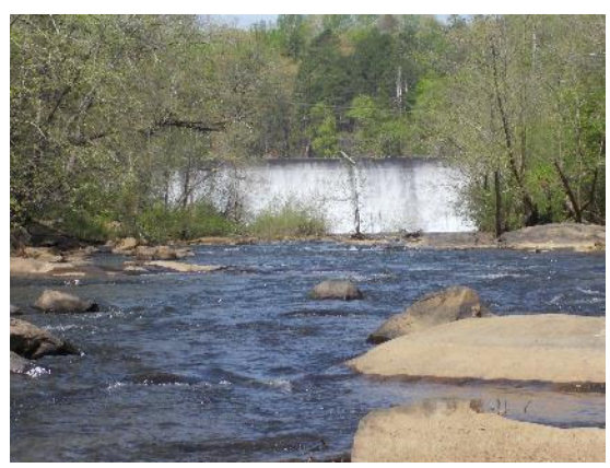
Figure 1: View of the Dam looking upstream