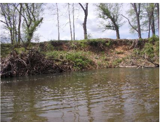
Figure 15: Erosion on bank at River Left before Confluence