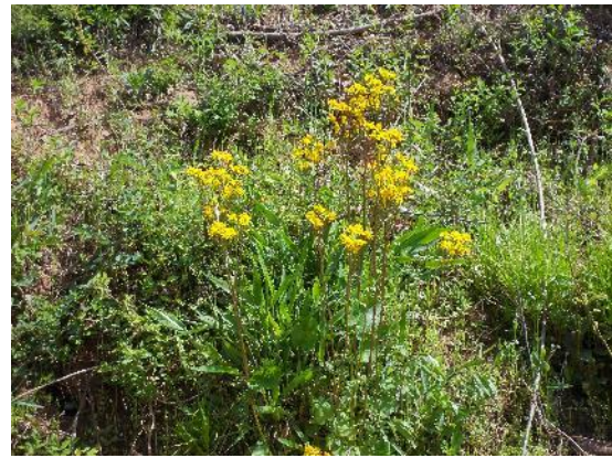
Figure 10: Yellow flowers blooming along the bank