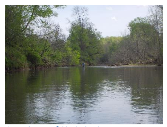
Figure 13: Person fishing in the River