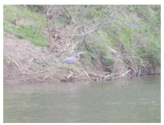
Figure 16: Great Blue Heron