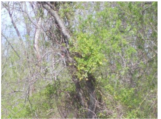
Figure 9: Green Heron perched in a tree