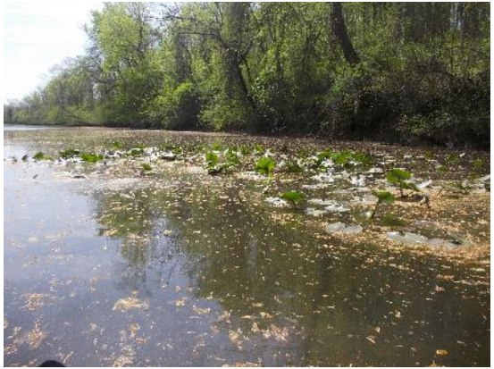
Figure 6: Underwater vegetation near 29 bridge