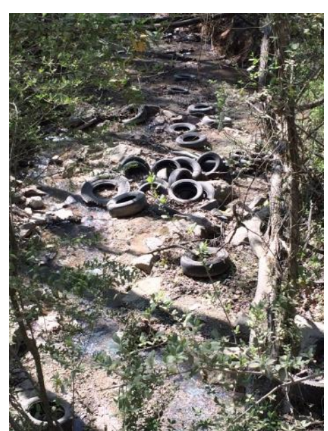
Figure 21: Example of the trash found in Schroeder's Branch which was previously reported to the County last year, but has not been cleaned up.