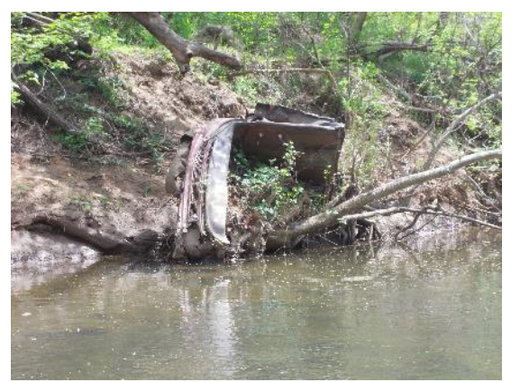
Figure 17: Car at River Left just before Darden boat ramp