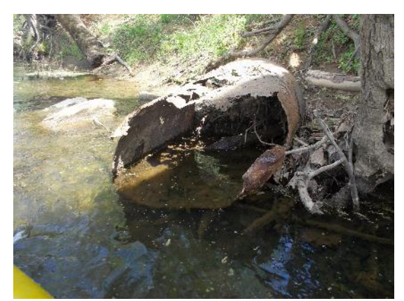
Figure 11: Large tank found floating in the River (GPS Coord: 38°05.649'N 78°26.666'W)