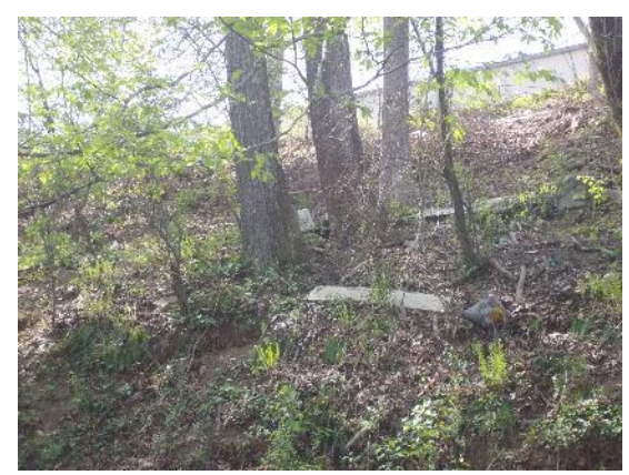
Figure 4: Construction Debris along bank at River Right below the shopping center just past the 29 Bridge