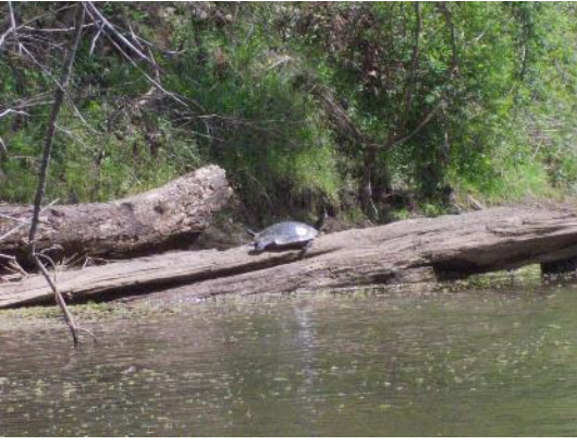
Figure 8: Turtle sunning on a log