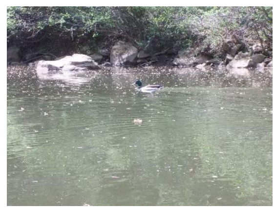
Figure 2: Duck swimming in the water