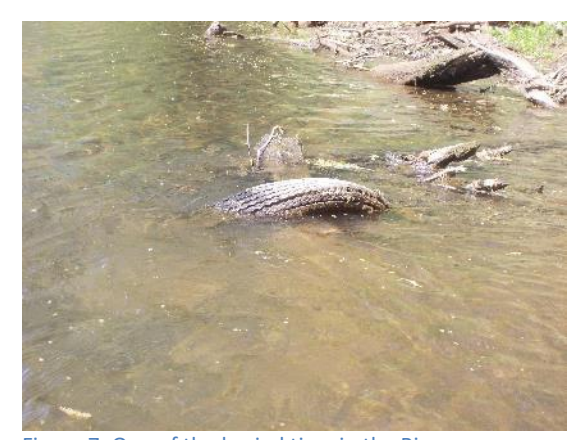
Figure 7: One of the buried tires in the River