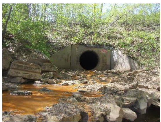
Figure 5: Pipe outfall at River Right just past 29 bridge