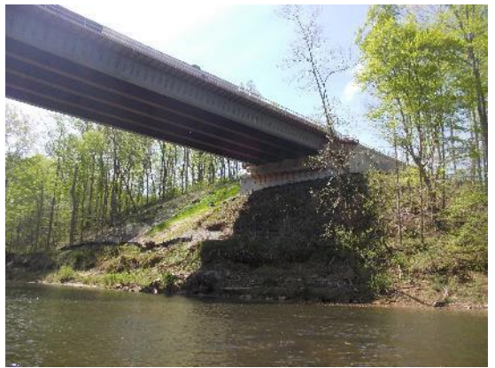
Figure 3: Bridge work just below the Dam