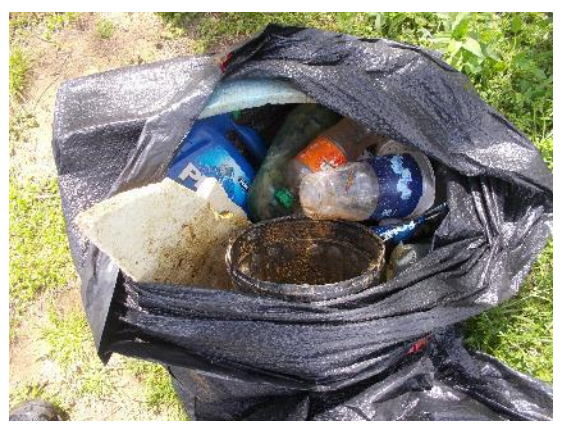
Figure 18: Trash collected during the paddle