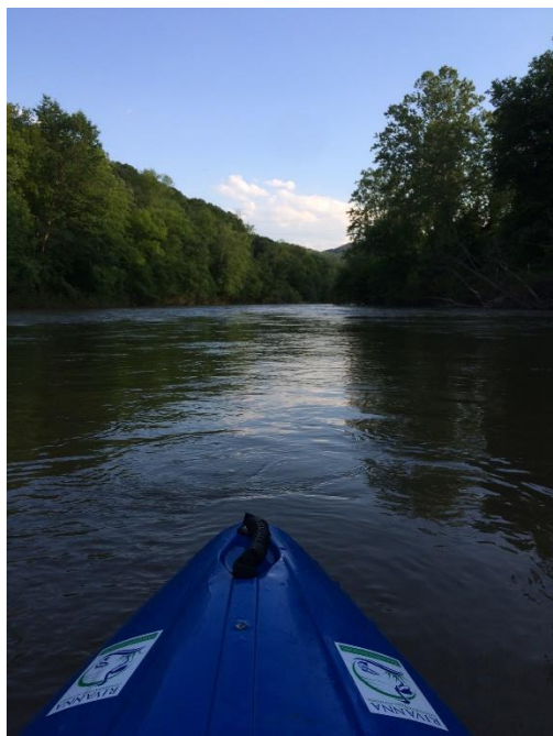
Figure 5: Early evening paddle, half sun, half shade.