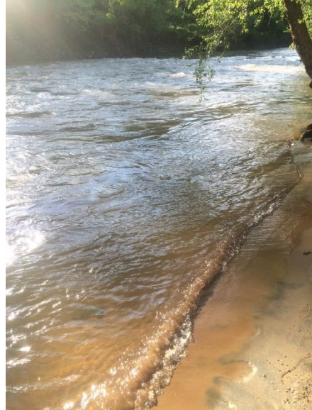
Figure 2: High water levels at Darden.