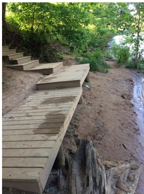
Figure 6: Riverview access project still intact!!