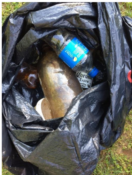
Figure 7: Trash collected during paddle.