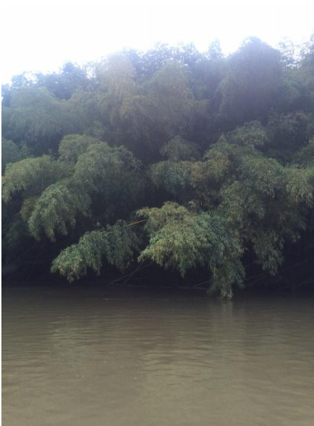
Figure 3: Thick bamboo along City side of River.