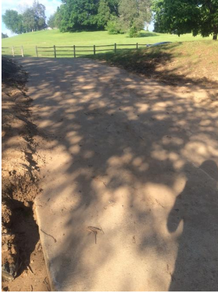
Figure 1: Sedimentation on Darden access ramp.