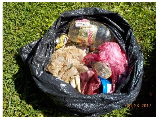
Figure 10: Bag of trash collected during the paddle