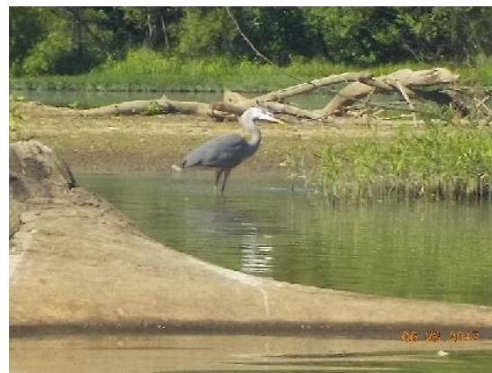
Figure 5: Great Blue Heron looking for fish to eat