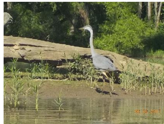
Figure 6: Last of the Great Blue Heron photos