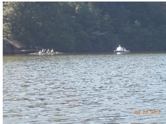
Figure 8: Local high school rowing team practicing