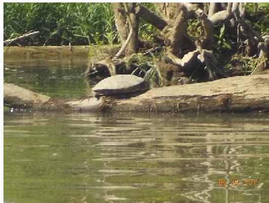
Figure 4: Turtle resting on a log