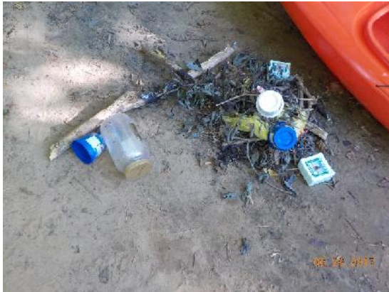
Figure 1: Trash found at bottom of trail at Reas Ford Rd