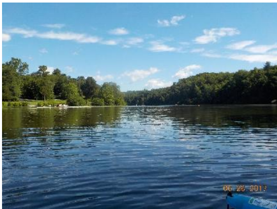
Figure 9: Reservoir looking upstream at UVA Boat Dock