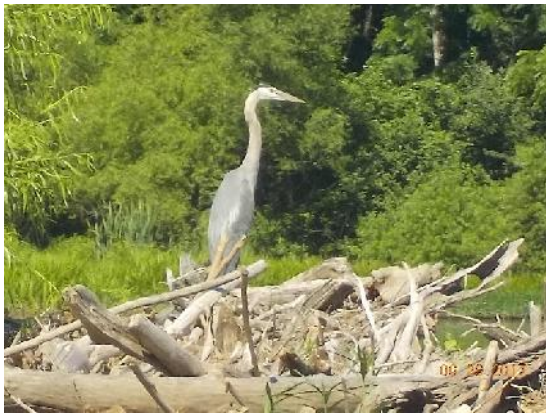
Figure 3: First on several Great Blue Herons seen