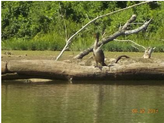
Figure 7: Unidentified large bird (Goose?) resting on a log