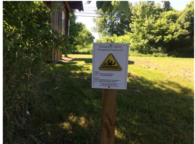
Figure 2: RCA installed emergency sign.