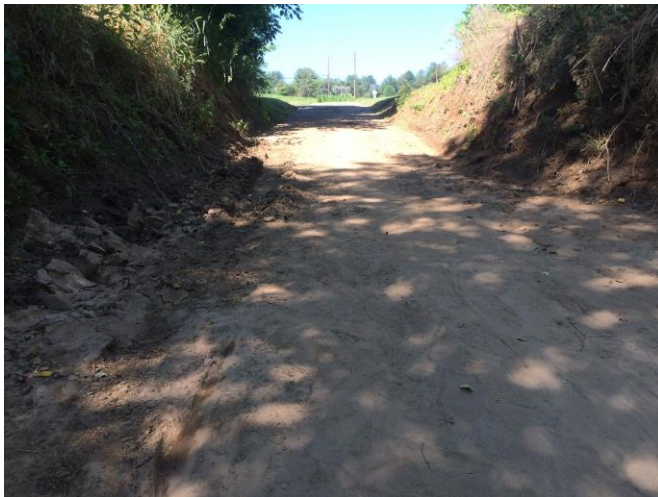
Figure 3: Sediment on Palmyra access ramp.