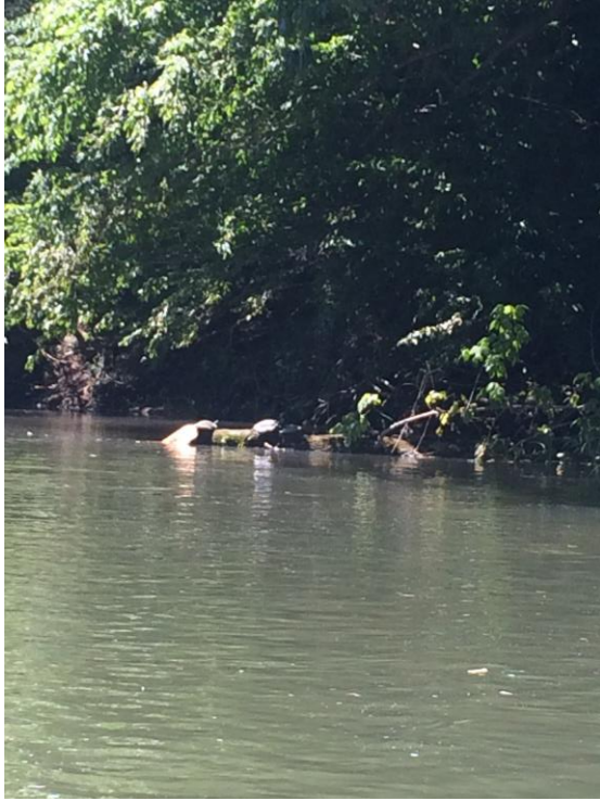
Figure 5: A group of turtles sunbathing.