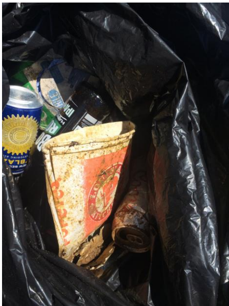
Figure 11: Trash collected.