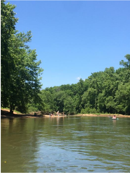
Figure 9: Large group at Pleasant Grove beach.