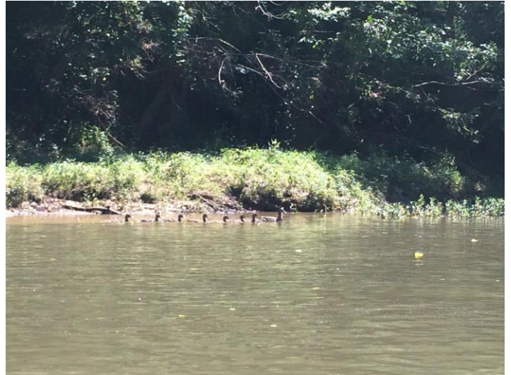
Figure 6: A Duck family.