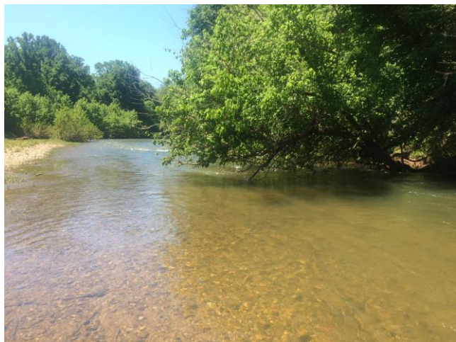
Figure 8: Tree blocking River passage.