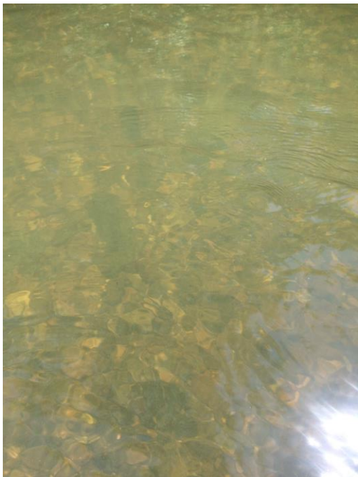
Figure 7: Clarity of water.