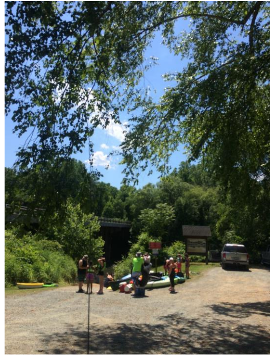
Figure 10: Large group at Crofton.