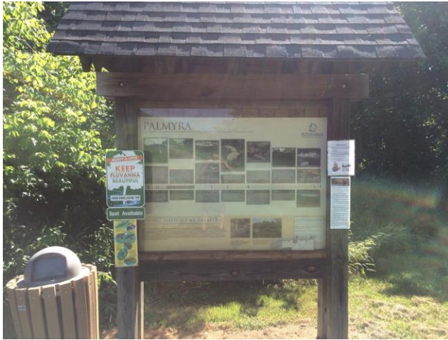
Figure 1: Newly installed historic panels in RCA Palmyra kiosk.