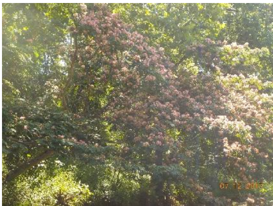
Figure 9: Mimosa tree in full bloom