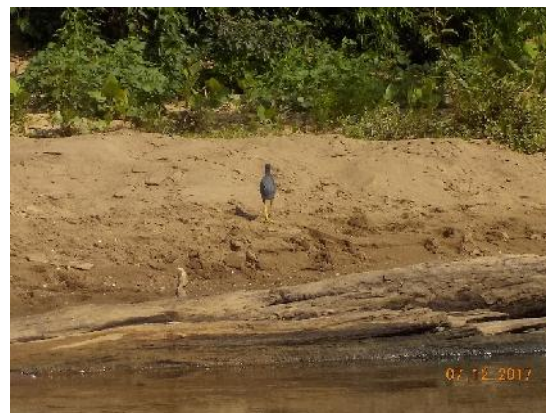
Figure 5: Green Heron along the bank