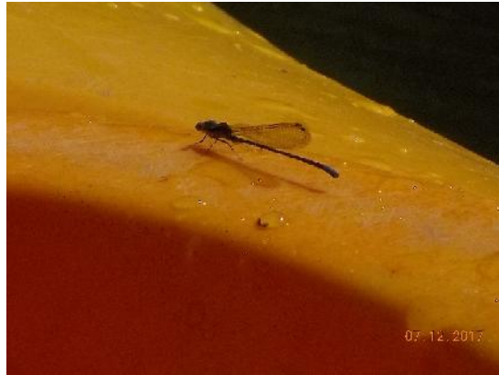
Figure 8: Damselfly riding on one of our kayaks