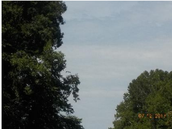
Figure 13: Osprey flying in the distance