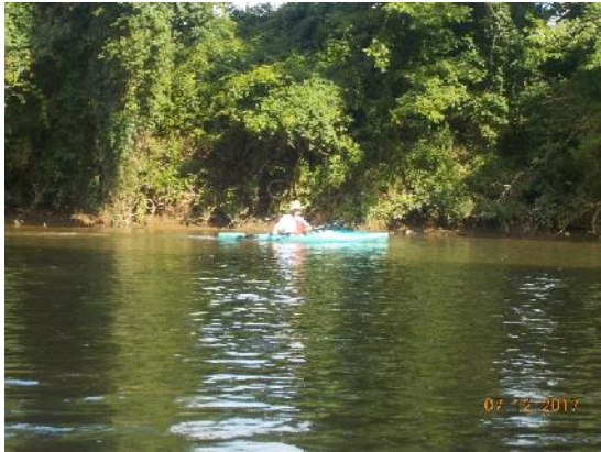
Figure 1: One of the other kayakers we saw today