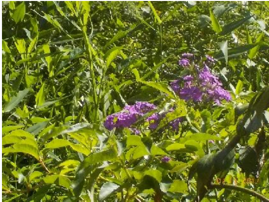
Figure 7: Purple flowers