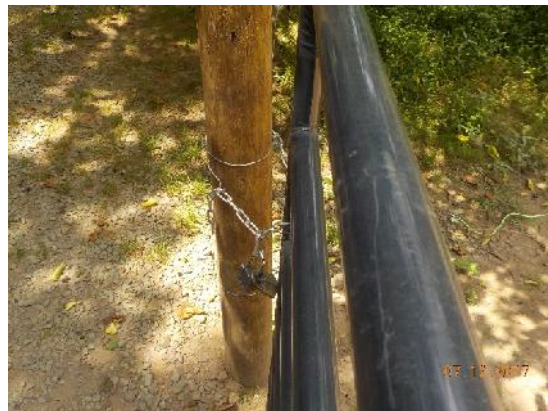
Figure 14: Gate at Milton that is not actually locked