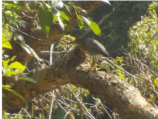
Figure 2: First of several Green Heron we saw