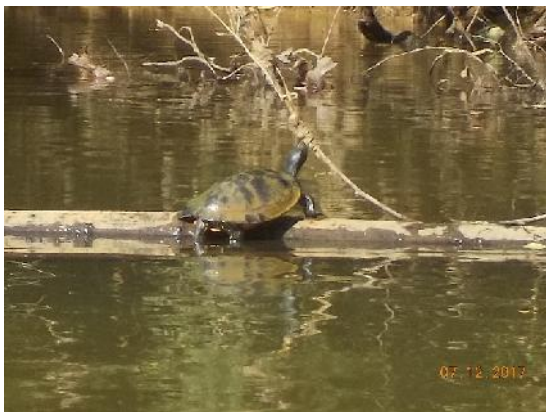
Figure 3: One of many turtles out sunning today