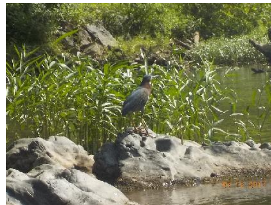
Figure 6: Another Green Heron