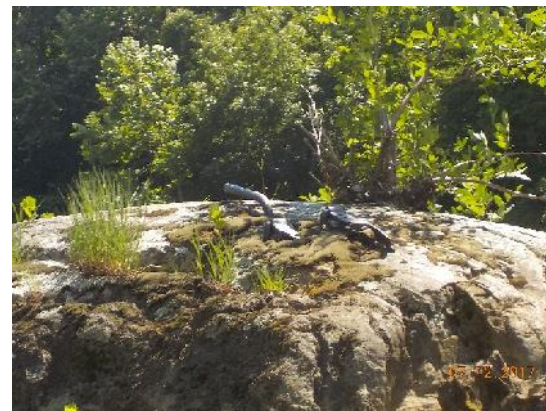
Figure 12: Rock with old foot bridge pieces still on it