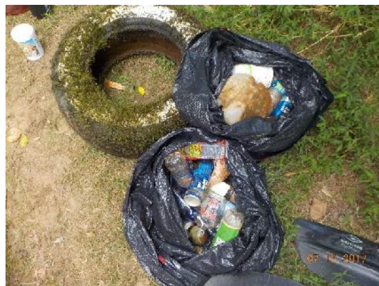
Figure 16: Trash collected during the paddle today