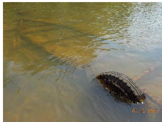
Figure 11: Buried trailer found in the River