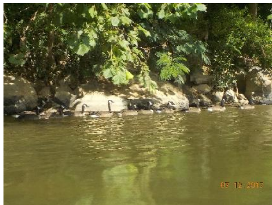
Figure 4: Group of geese swimming together