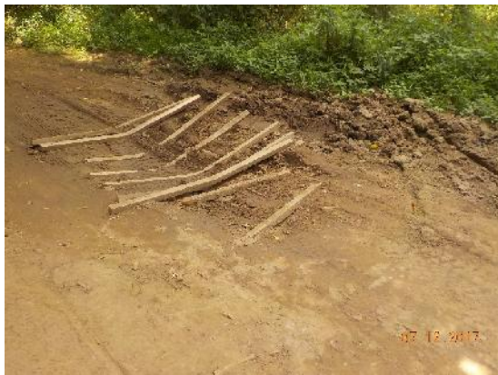
Figure 15: Muddy mess on dirt access road at Milton