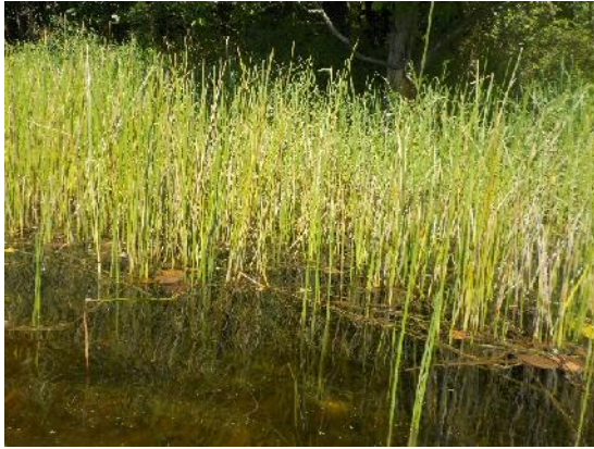
Figure 7: Grasses growing in the Reservoir