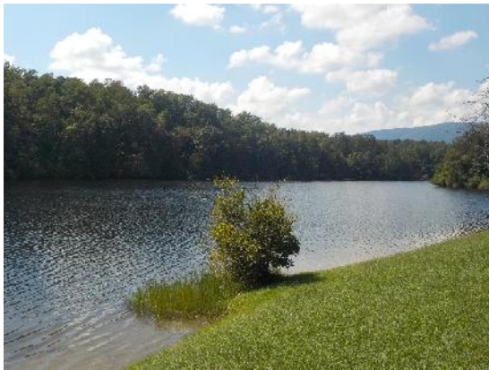
Figure 3: View of the Reservoir from the boat ramp