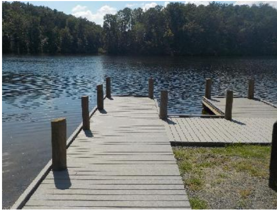
Figure 1: Recently installed piers at boat ramp