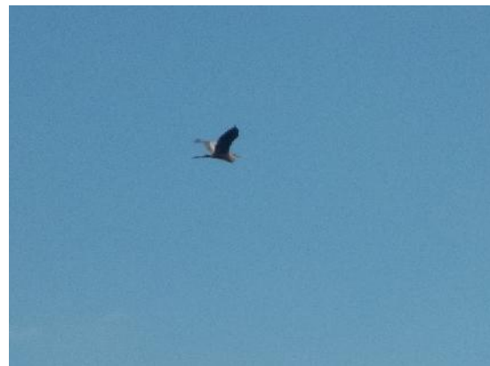
Figure 12: Another Blue Heron in flight