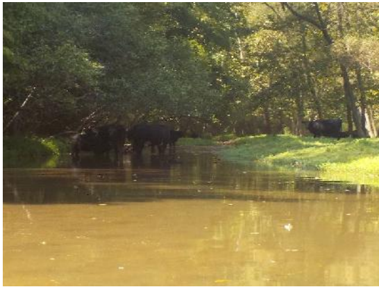
Figure 9: Cows in the water near Watts Branch