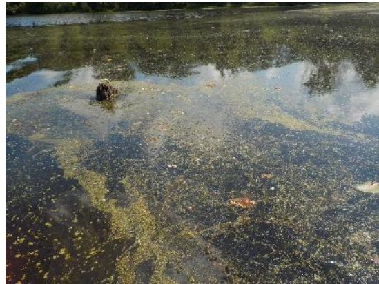
Figure 16: Another view of some of the algae seen today