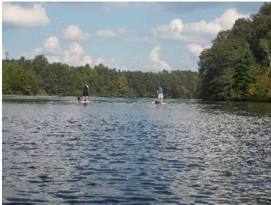
Figure 15: 2 people on SUPs