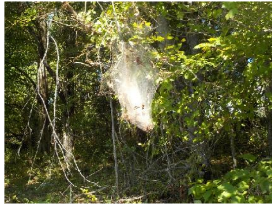
Figure 4: Web in one of the trees