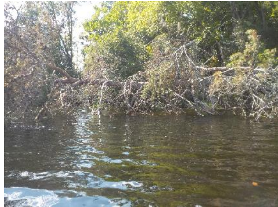
Figure 14: One of the larger downed trees