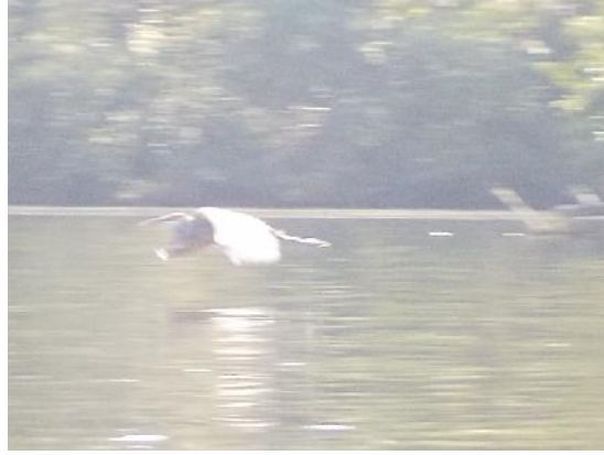
Figure 8: One of the Blue Herons in flight