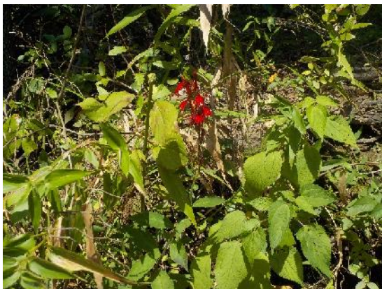
Figure 5: One of the many Cardinal flowers seen