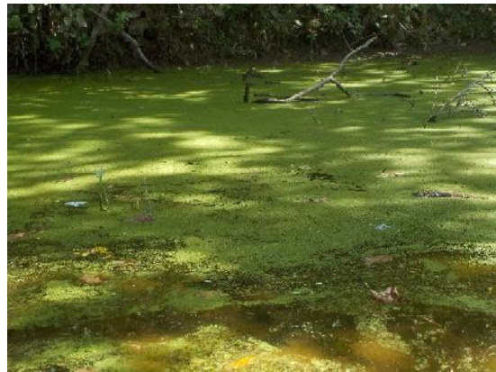
Figure 10: Example of green algae seen today