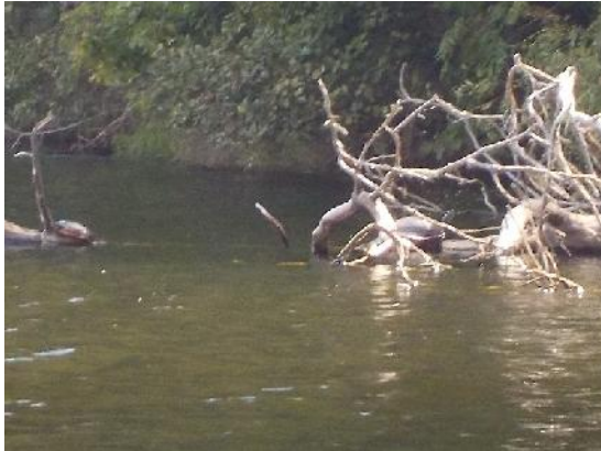
Figure 13: Turtles resting on a downed log