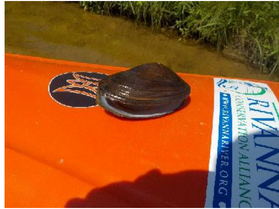
Figure 2: Mussel shell found in the Reservoir