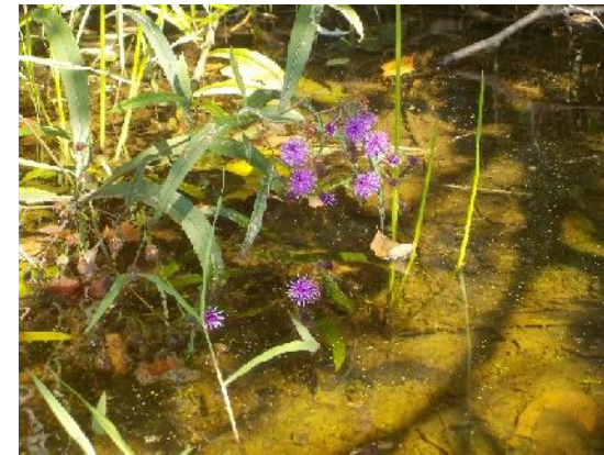
Figure 6: Purple flowers growing at water's edge