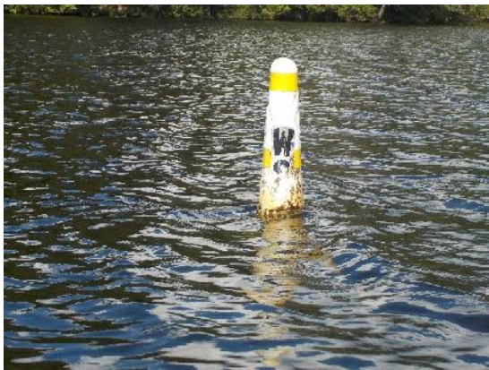
Figure 17: RWSA buoy floating in the Reservoir