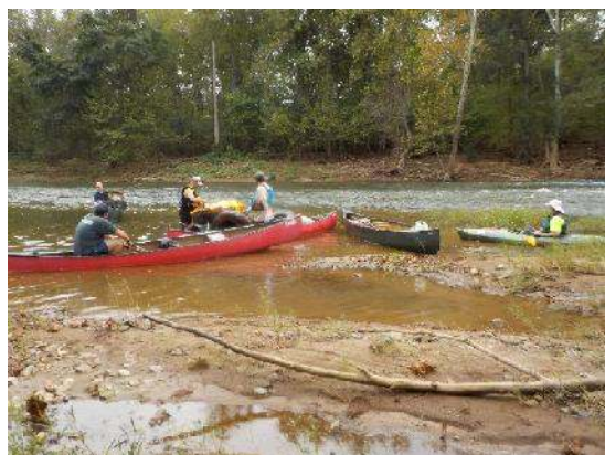
Figure 10: Taking a break before loading up more trash