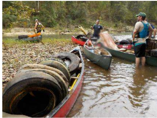
Figure 14: Realizing we are at full capacity for tires and trash