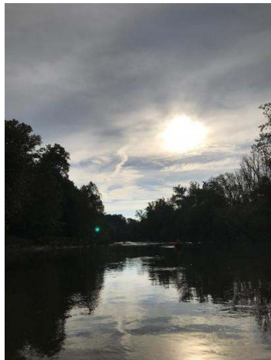
Figure 12: Sun coming out from behind the clouds