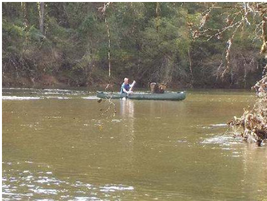
Figure 3: Alex paddling canoe with trash can in it