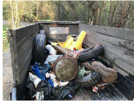
Figure 16: Dumpster full of trash removed from river today