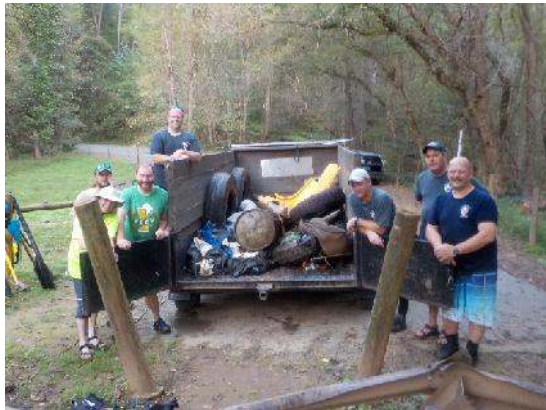
Figure 17: Group photo at Milton