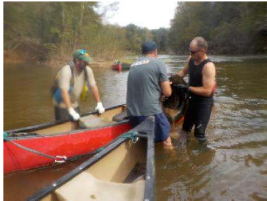
Figure 2: Loading tire into the canoe