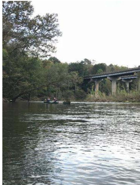
Figure 6: Roger and Alex paddled a canoe