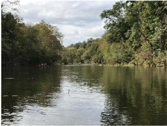
Figure 13: Chris and Dan paddling a canoe