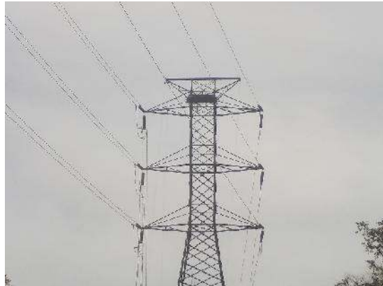
Figure 8: Eagle's nest on power line tower