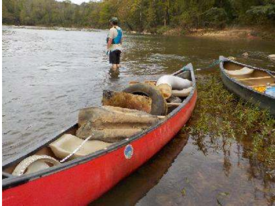
Figure 7: Canoe full of tires and other trash