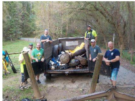
Figure 18: Another group photo at Milton