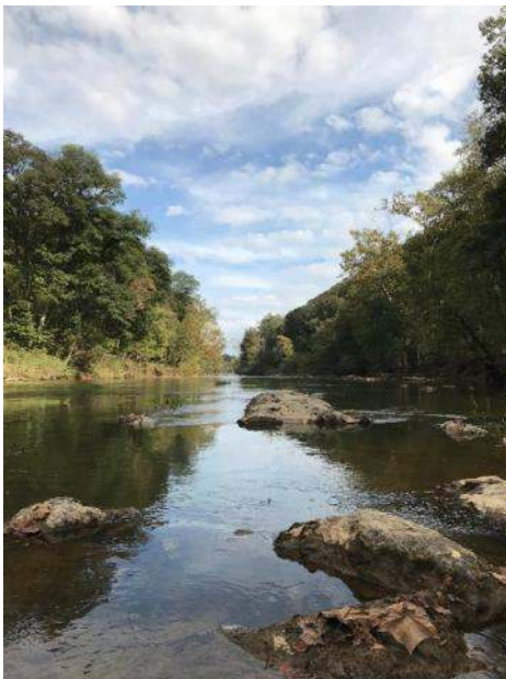
Figure 5: Nice view of the river