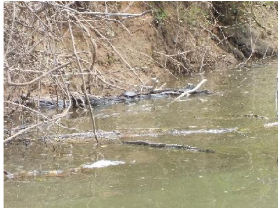
Figure 2: One of the turtles seen today