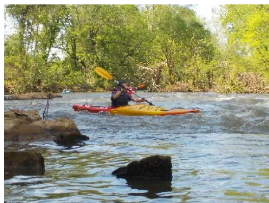
Figure 6: Rapid under Railroad Bridge