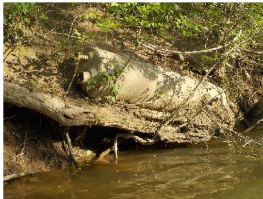
Figure 12: Large tank at River left just below Darden Towe