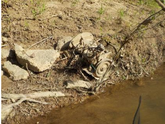
Figure 13: Another large object near the tank if Figure 12