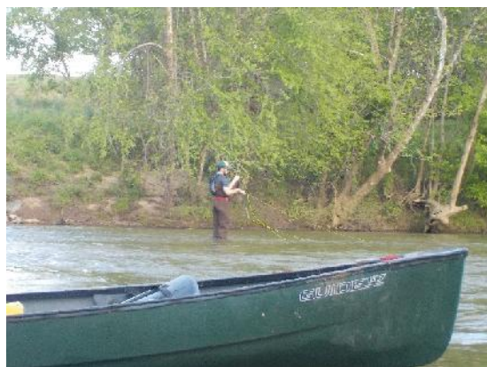
Figure 11: Someone fishing near Darden Towe Park