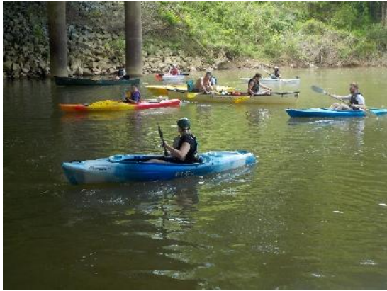
Figure 1: Starting the paddle under 29 bridge