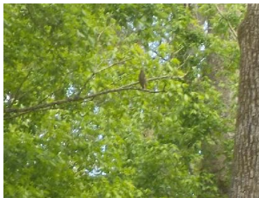
Figure 8: Green Heron sitting in a tree