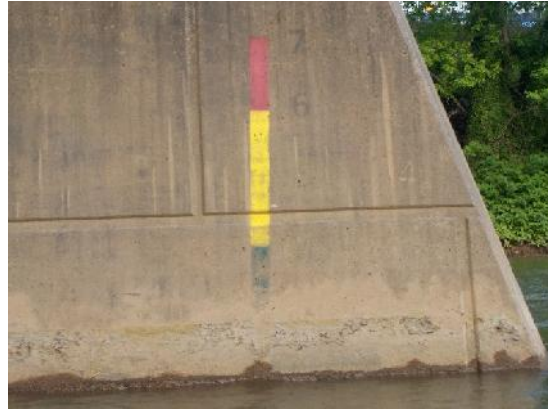
Figure 14: Paint on Free Bridge abutment is fading