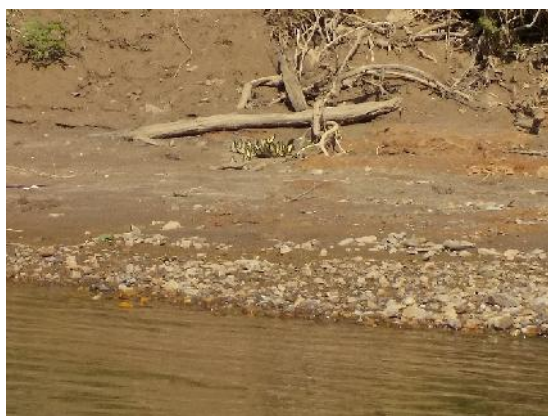
Figure 9: Large group of butterflies