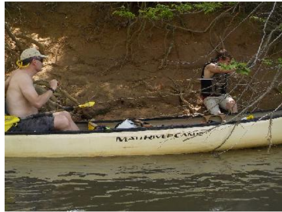
Figure 4: Removing trash from a tree limb