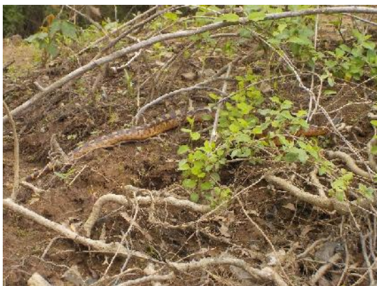
Figure 5: Snake along the river bank (possibly an Eastern Hognose Snake)