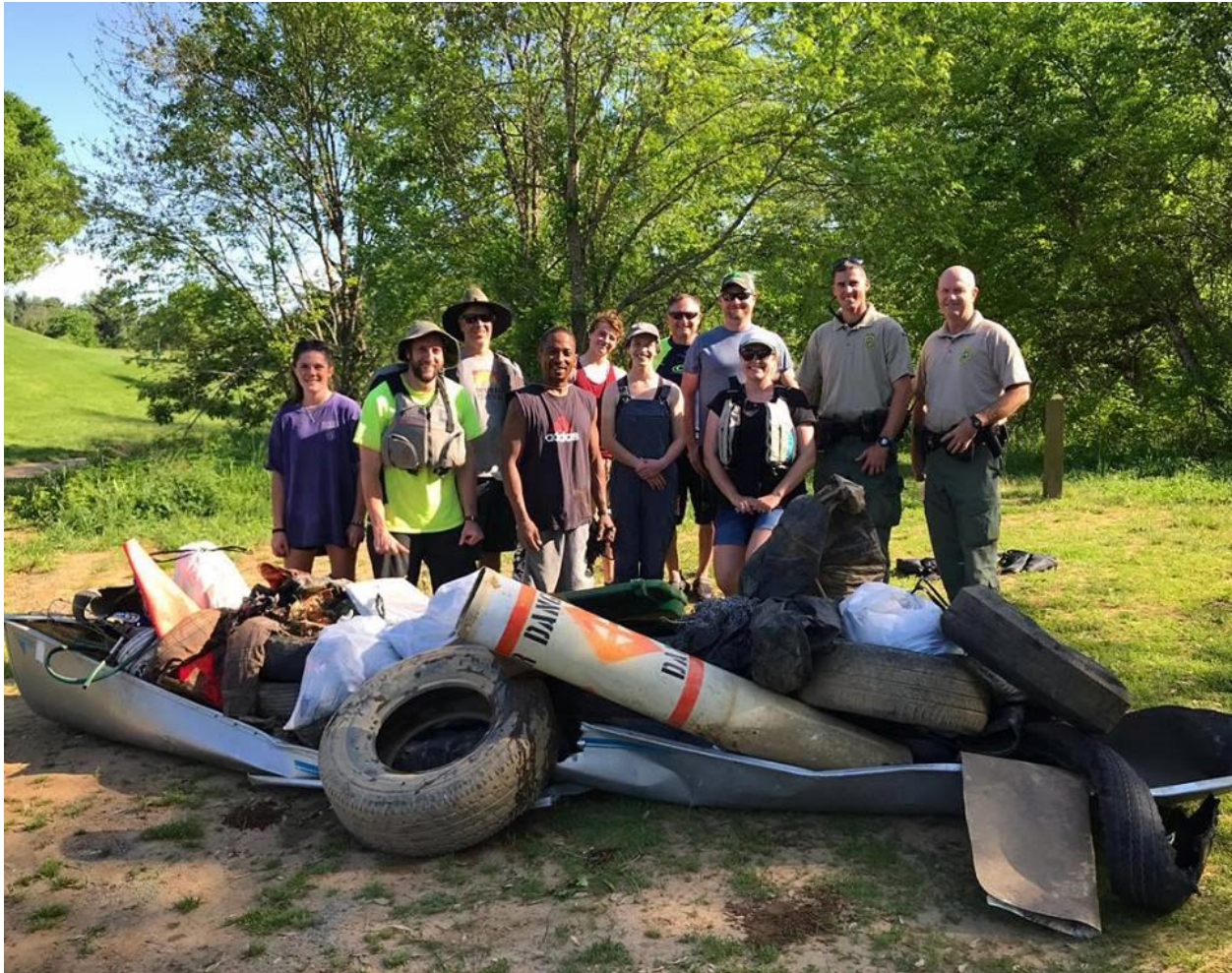
Figure 15: Group Photo