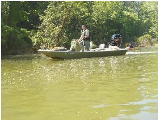
Figure 3: DGIF Jet Boat