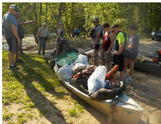
Figure 10: Trash collected being dropped at Darden Towe