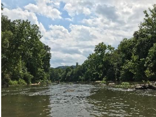
Figure 7: View of Woolen Mills