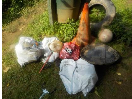
Figure 16: Trash collected from the River today