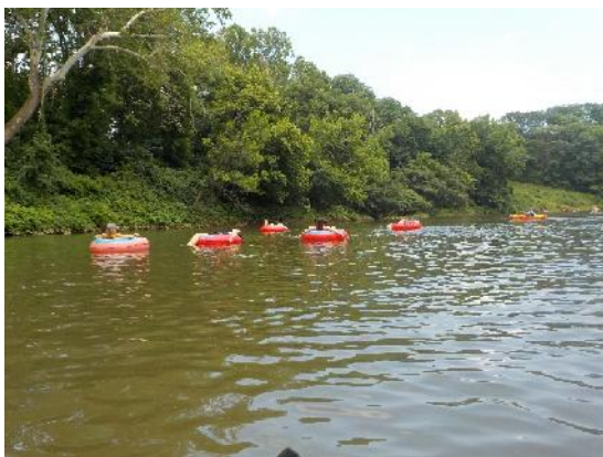
Figure 5: Group of tubers relaxing on the River