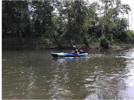
Figure 14: Dan paddling with lots of trash attached to kayak