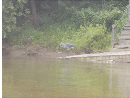
Figure 8: Blue Heron looking for a snack in the water