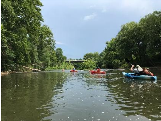
Figure 15: Nearing the end of the paddle