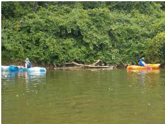
Figure 3: Julia and Lisa investigating invasive vegetation