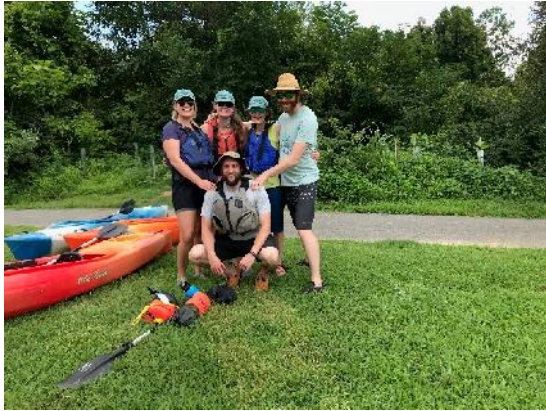
Figure 1: RCA Staff photo at RRC