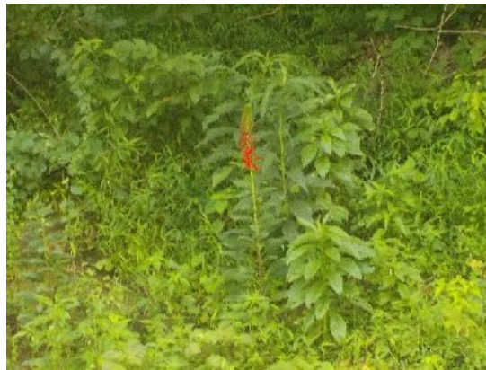
Figure 10: Cardinal flower in bloom