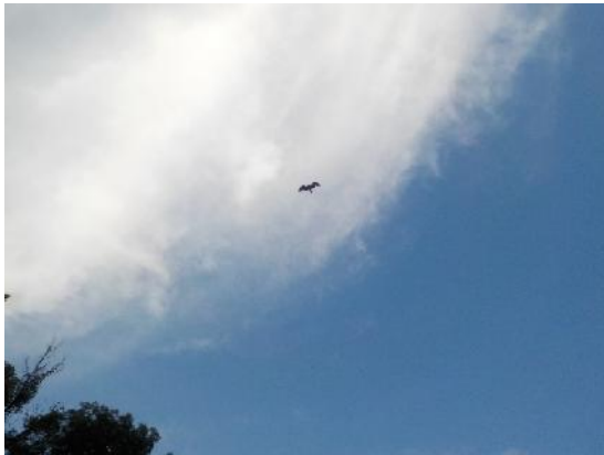
Figure 9: Osprey flying overhead