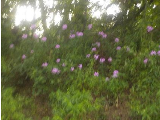
Figure 13: Purple flowering blooms