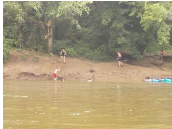
Figure 4: Group of people enjoying one of the rope swings