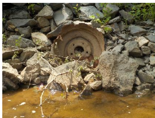
Figure 6: Metal piece of a wheel hub just upstream of Riverview