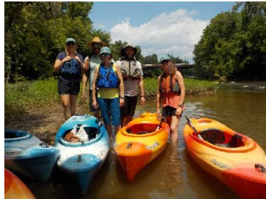
Figure 2: RCA staff getting in the River