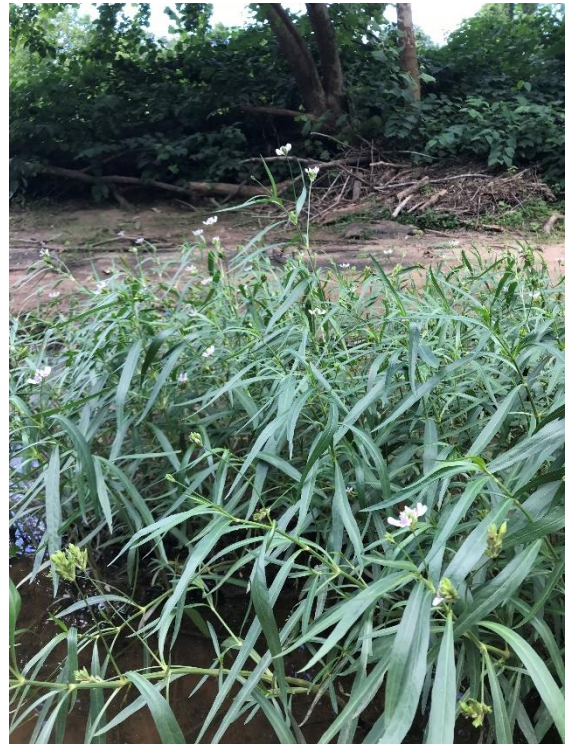
Figure 2: Blooming River flora.