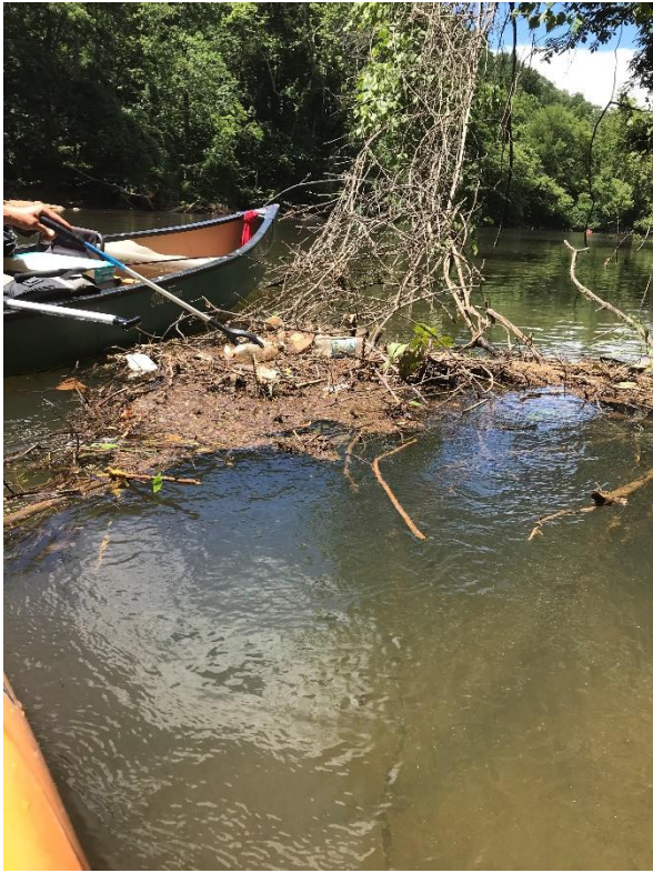
Figure 5: Trash collecting in stagnant pool.