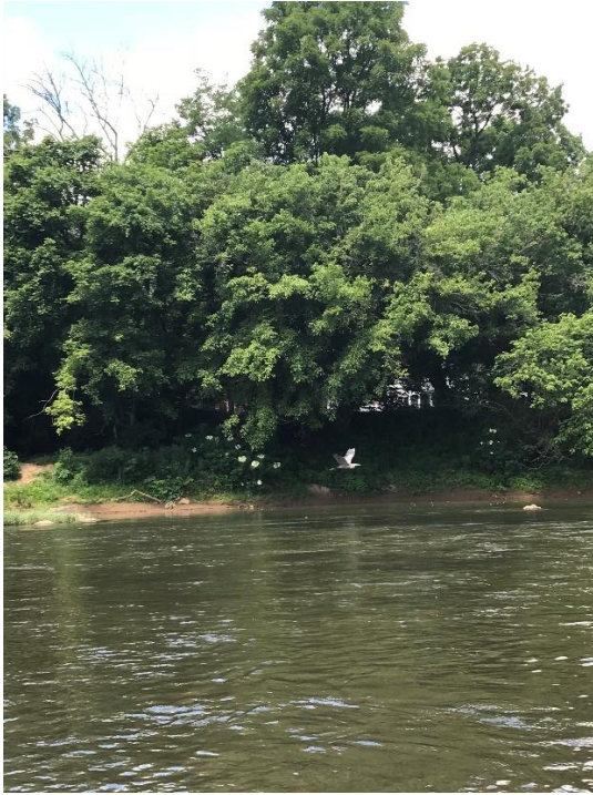
Figure 1: Blue Heron taking flight.