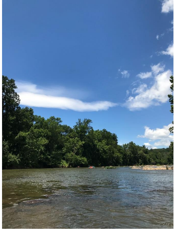
Figure 10: Large paddling group encountered.