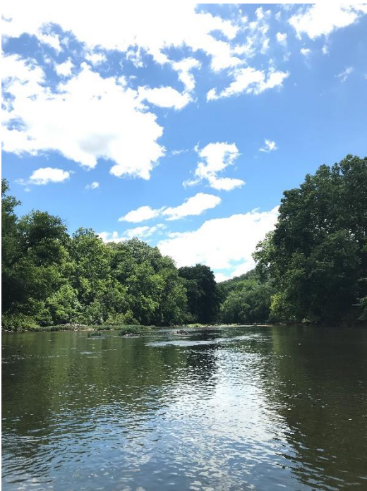
Figure 3: Blue skies over Rivanna River.