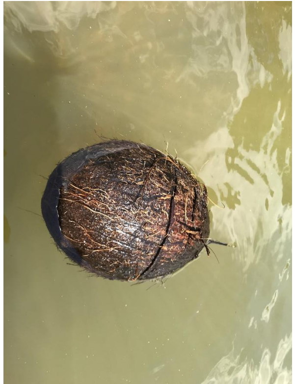
Figure 8: And here is a coconut!!?!.