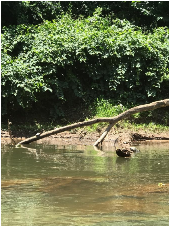
Figure 7: Turtle diving into River.