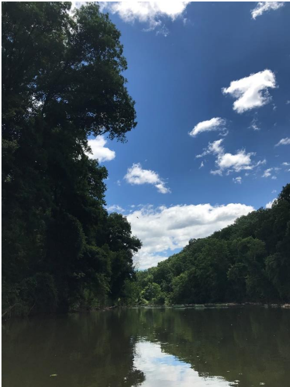
Figure 11: Distant Eagle flying over River.