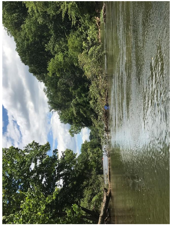
Figure 6: Strainer to be addressed on River.