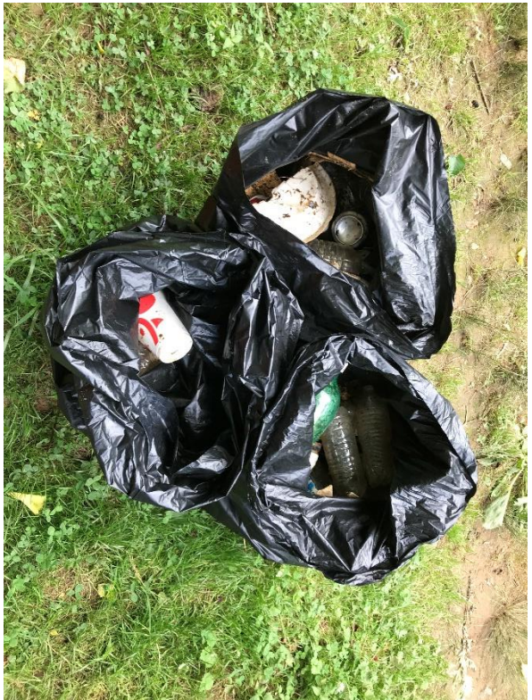
Figure 12: Example of trash removed from River.