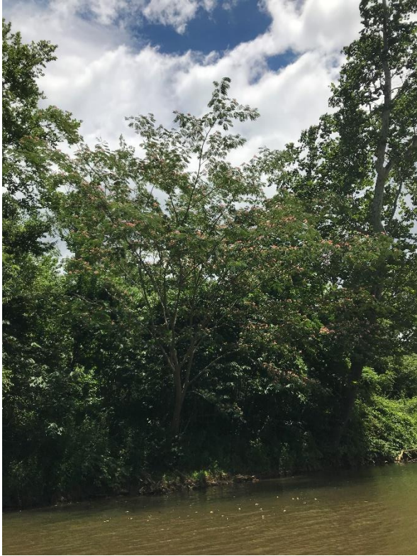
Figure 9: Large blooming Mimosa tree.