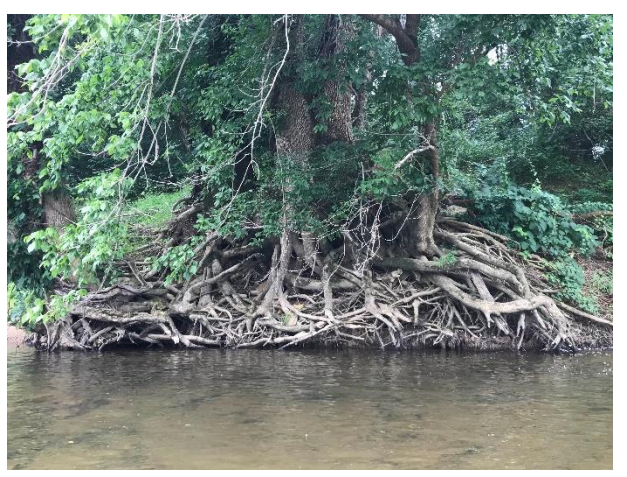
Figure 7: Tree root art along the banks.