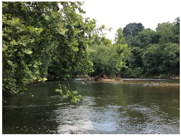
Figure 3: More Community members enjoying River.