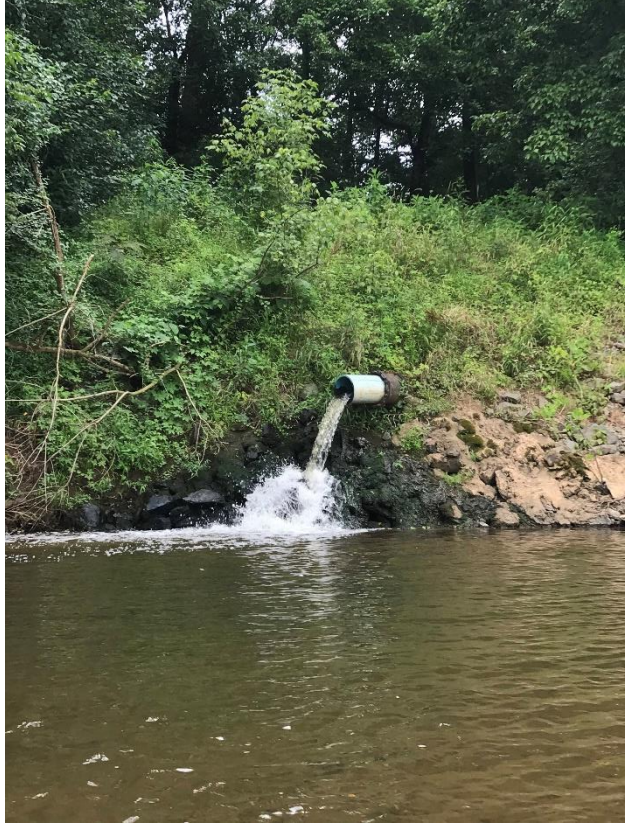
Figure 5: Active pipe outfall near Crofton Access.