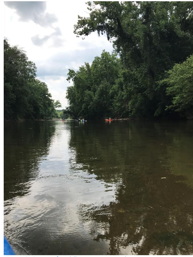
Figure 6: Group of paddlers encountered.