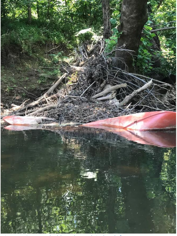
Figure 10: Mangled kayak stuck in bank from storm surge.