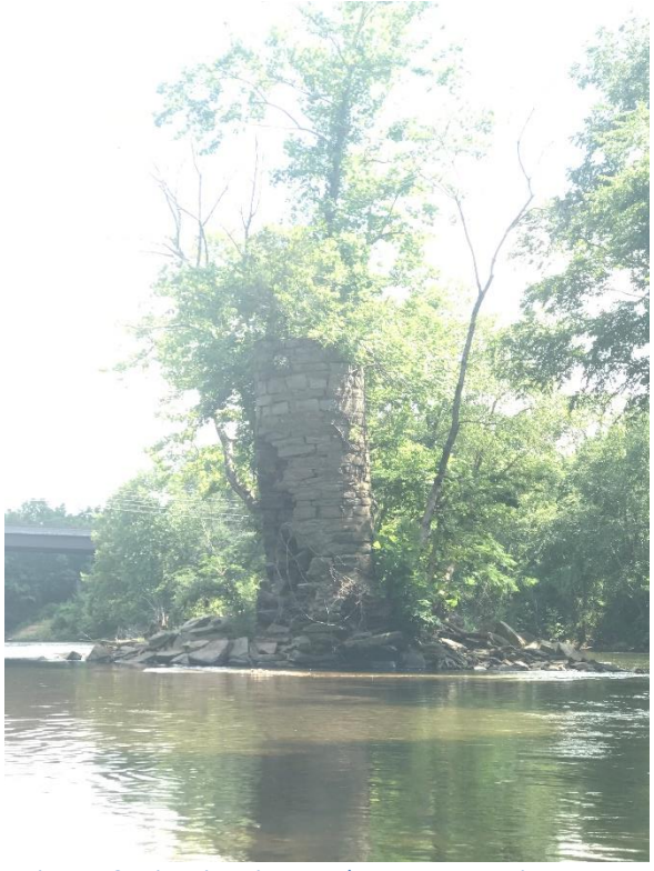
Figure 12: Historic Ruins at Palmyra Access Point.