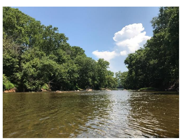
Figure 8: Views of skyline along the Rivanna.