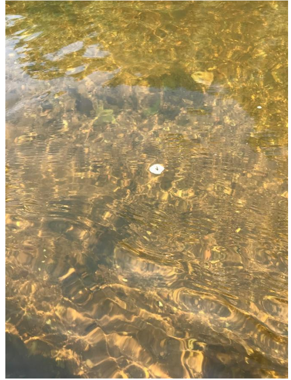
Figure 9: Example of clarity of water.