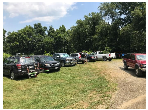
Figure 1: Vehicles at Palmyra Access Point.