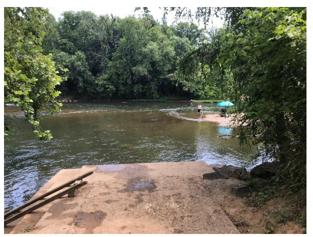
Figure 2: Community members enjoying River at Palmyra