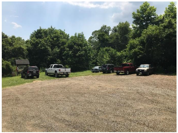
Figure 2: More vehicles at Palmyra Access Point.