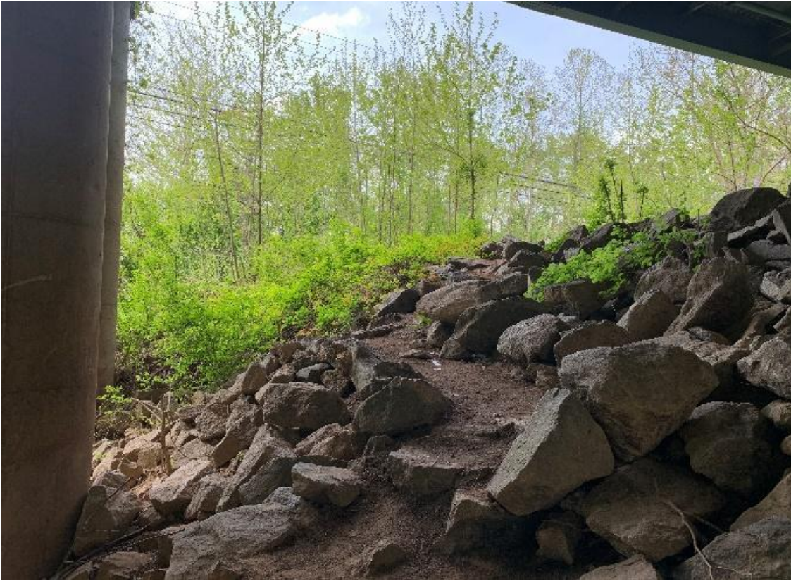
Figure 1: Put in under the Route 29 bridge at Brook Hill River Park.