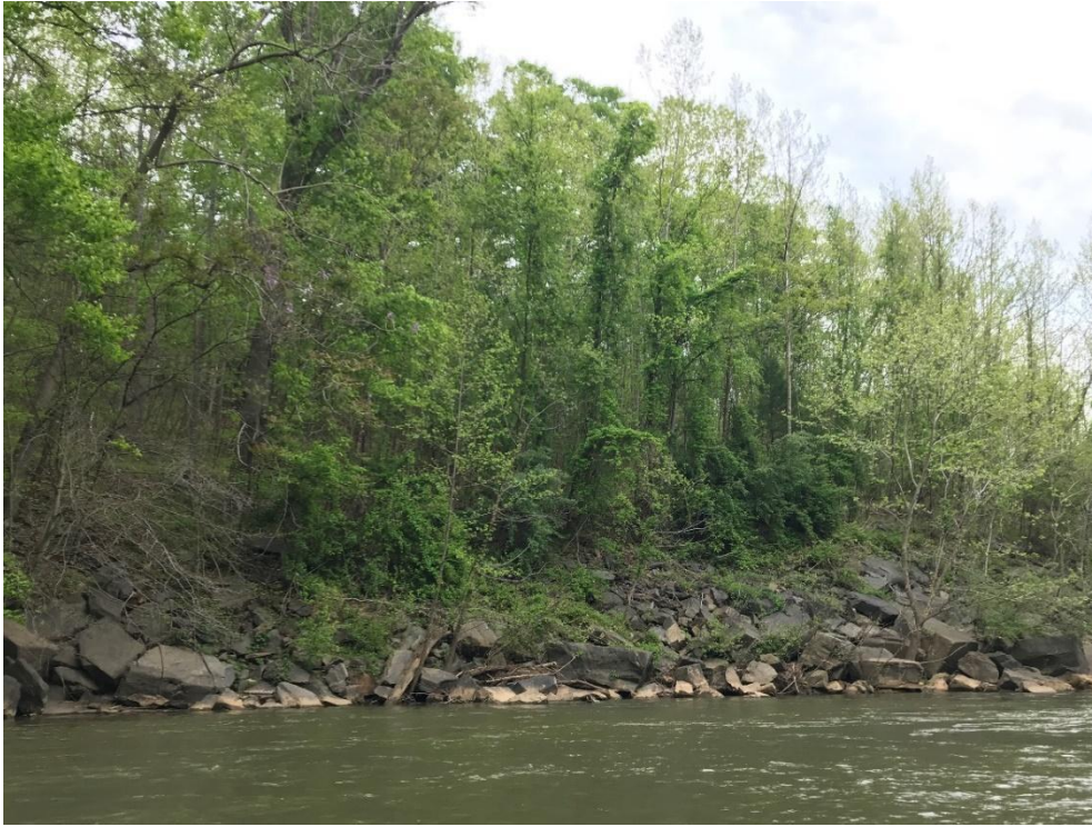
Figure 5: Rocky banks occurring along river right.