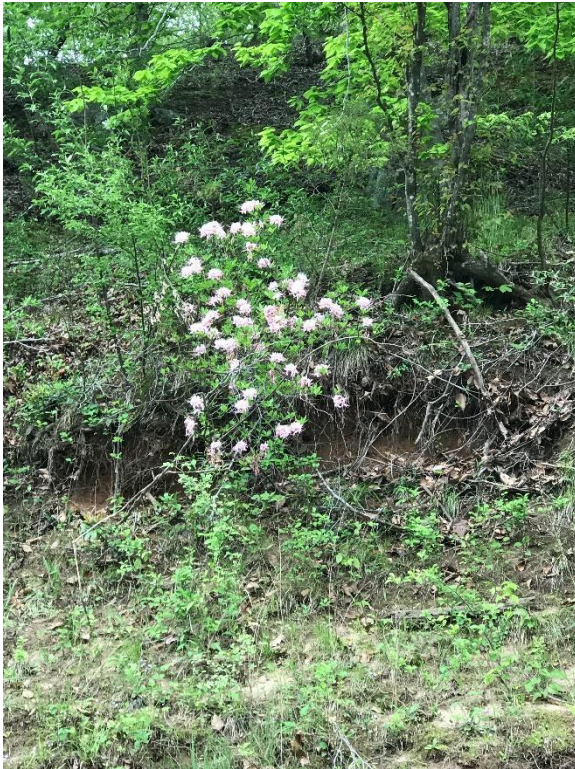
Figure 6: Blooming flora along the bank.