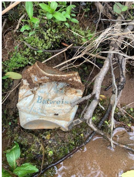
Figure 2: Many old beer cans were found downstream of the Rt. 29 bridge