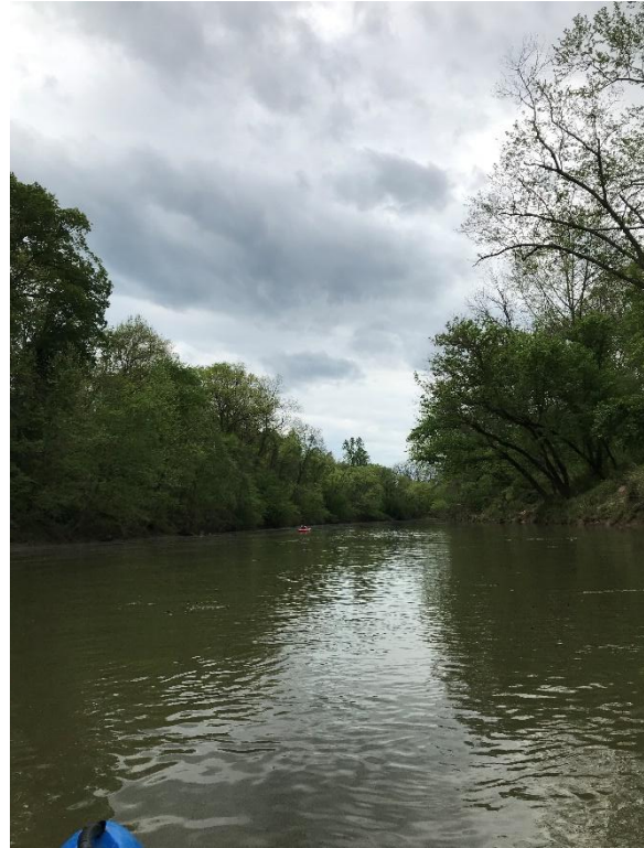
Figure 7: View from the river.