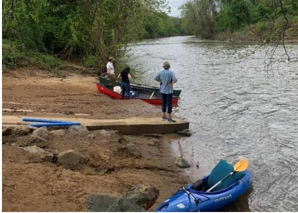
Figure 8: Community members at Darden Towe Park boat ramp.