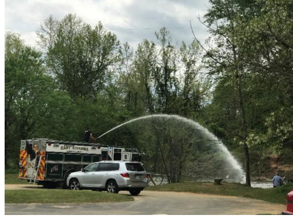
Figure 9: Local Fire Dept. water pumping drill at Darden Towe Park boat ramp.