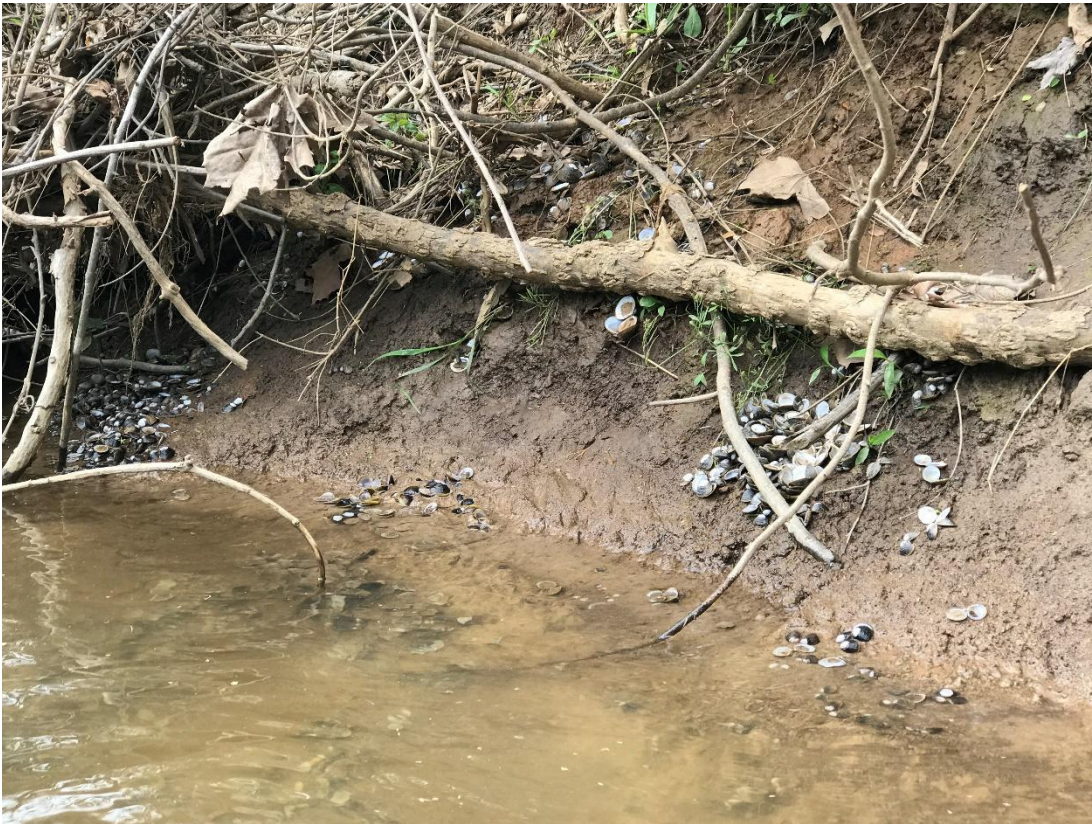
Figure 4: Asian clam (invasive) observed along the bank.