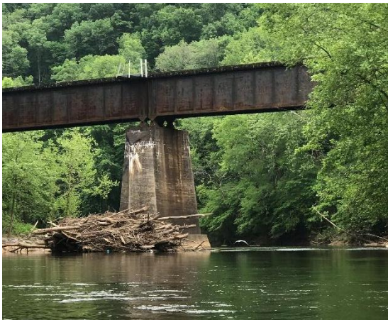
Figure 5: Blue Heron takes flight to the right of wood buildup at railroad bridge.