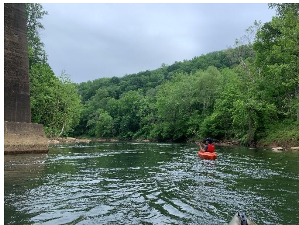
Figure 6: View passing under the railroad bridge just downstream of I-64.