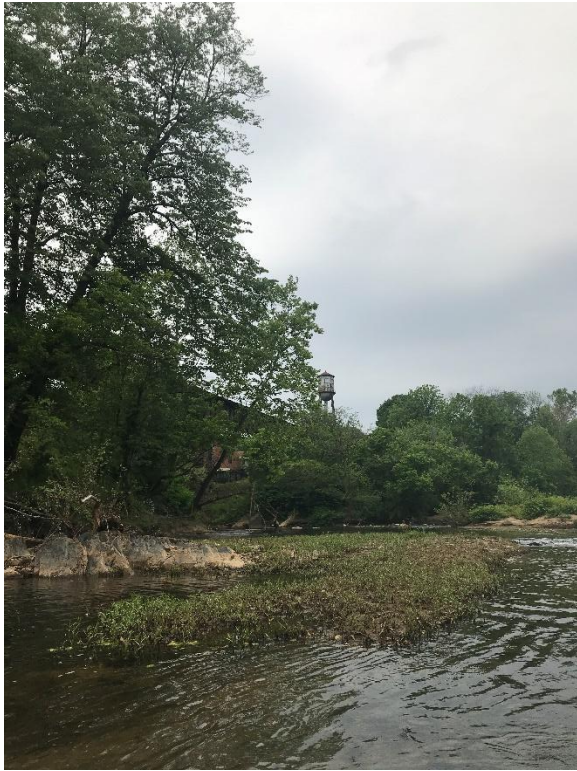
Figure 3: Confluence with Moores Creek.