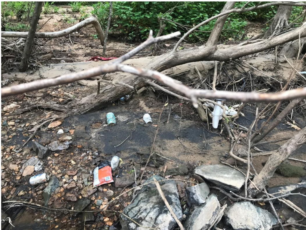
Figure 8: Prevalent trash observed along strainer land areas along the banks.