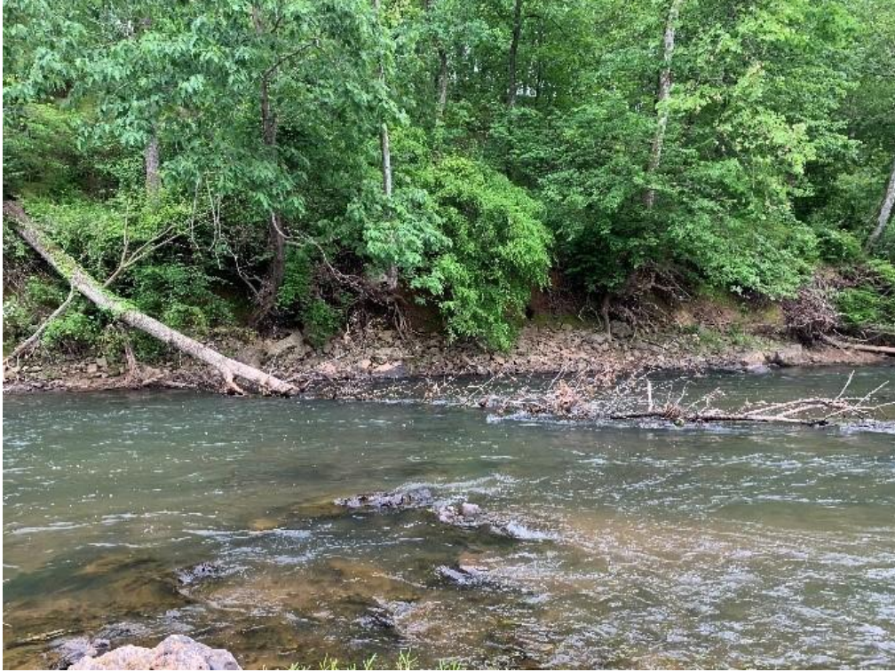
Figure 1: Downed tree has created a strainer on river left. View is from center of river across from Riverview Park boat launch.