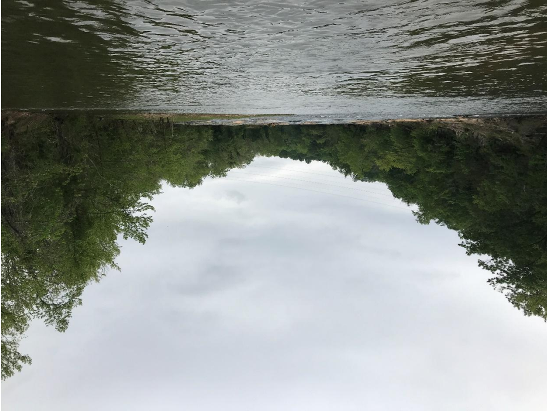
Figure 7: Which is the River and which is the sky?.