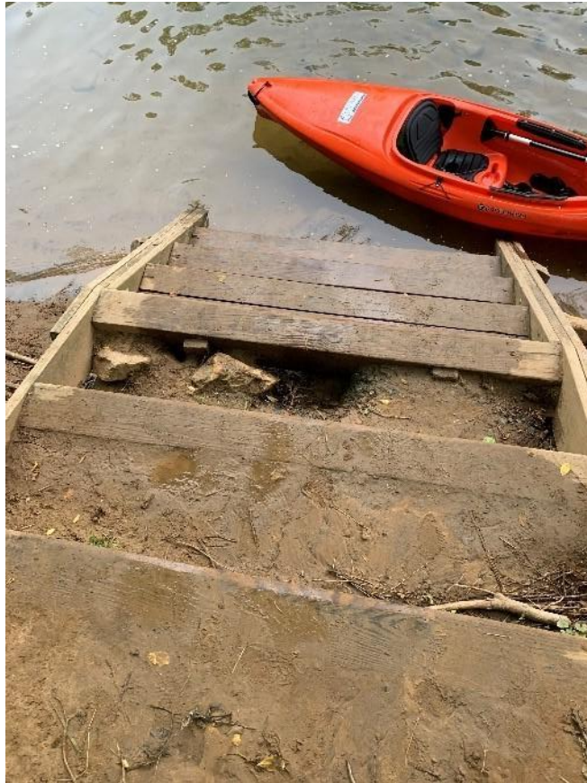
Figure 9: Milton access steps experiencing erosion that will need to be addressed to avoid creation of a hazard.