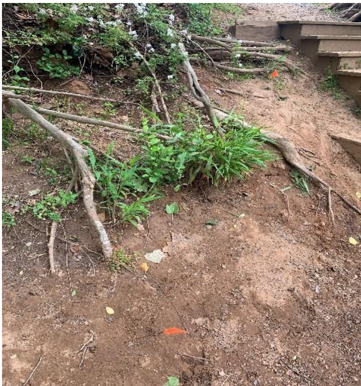
Figure 2: Orange flags signal RCA livestake planting locations at Riverview Park, some of which have been removed or damaged.