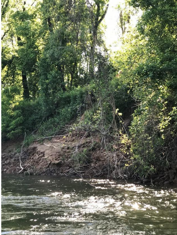
Figure 6: Additional bank erosion along river right near Riverview Park.