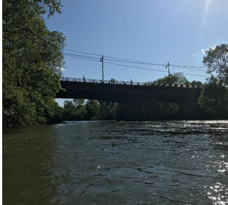
Figure 3: Free Bridge looking downstream where the 250 bypass crosses the Rivanna