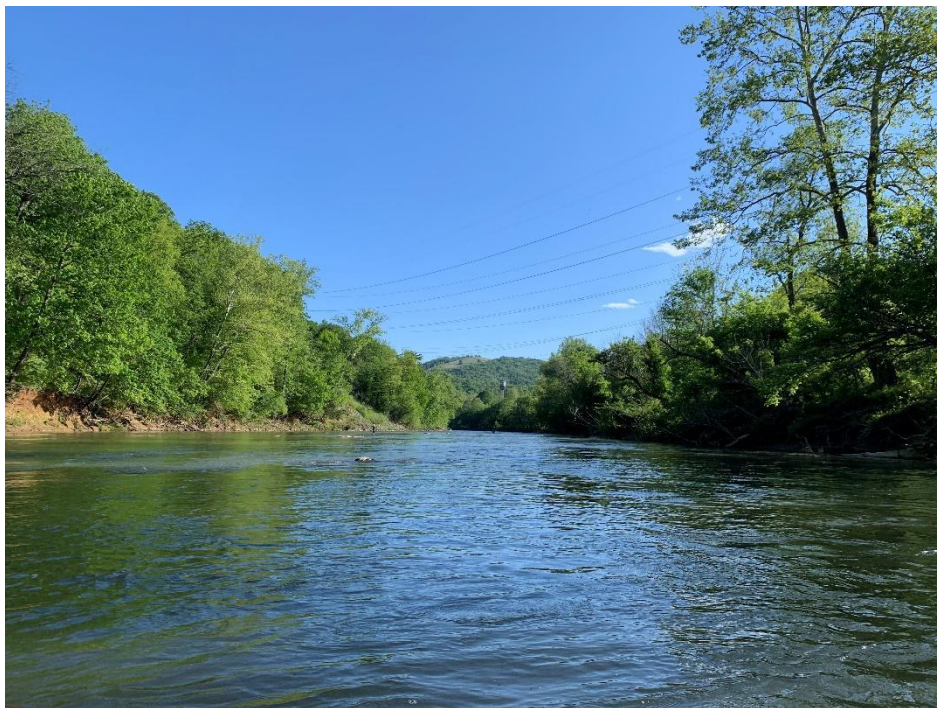
Figure 8: View of Montalto and the water tower signal the conclusion of the paddle trip.