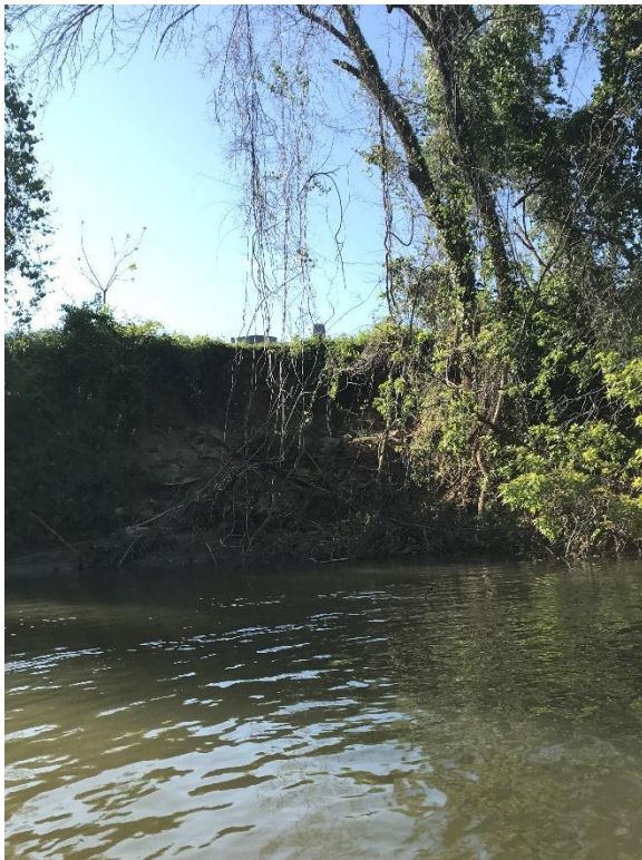
Figure 4: More bank erosion on river right along the Rivanna Trail.