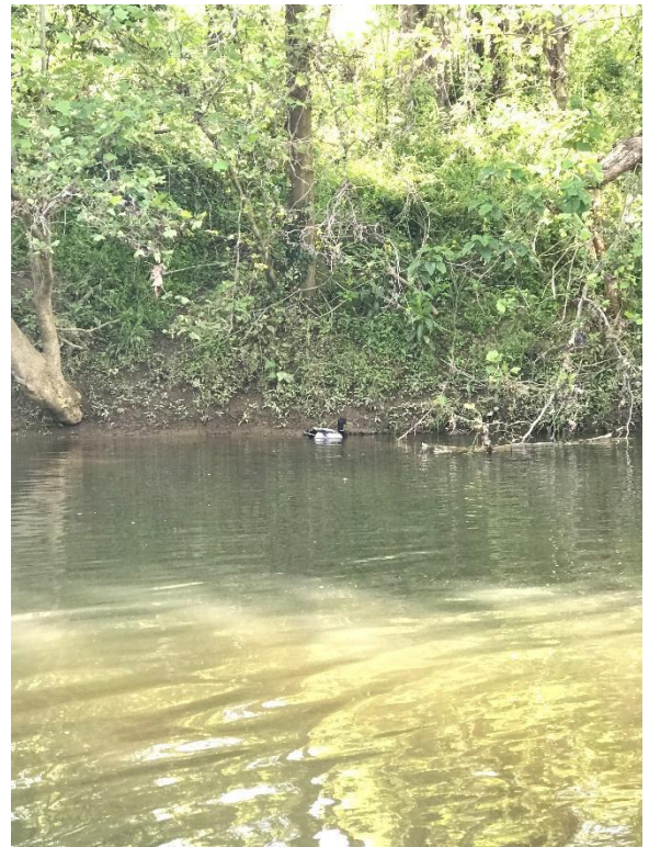
Figure 5: Duck enjoying the river.