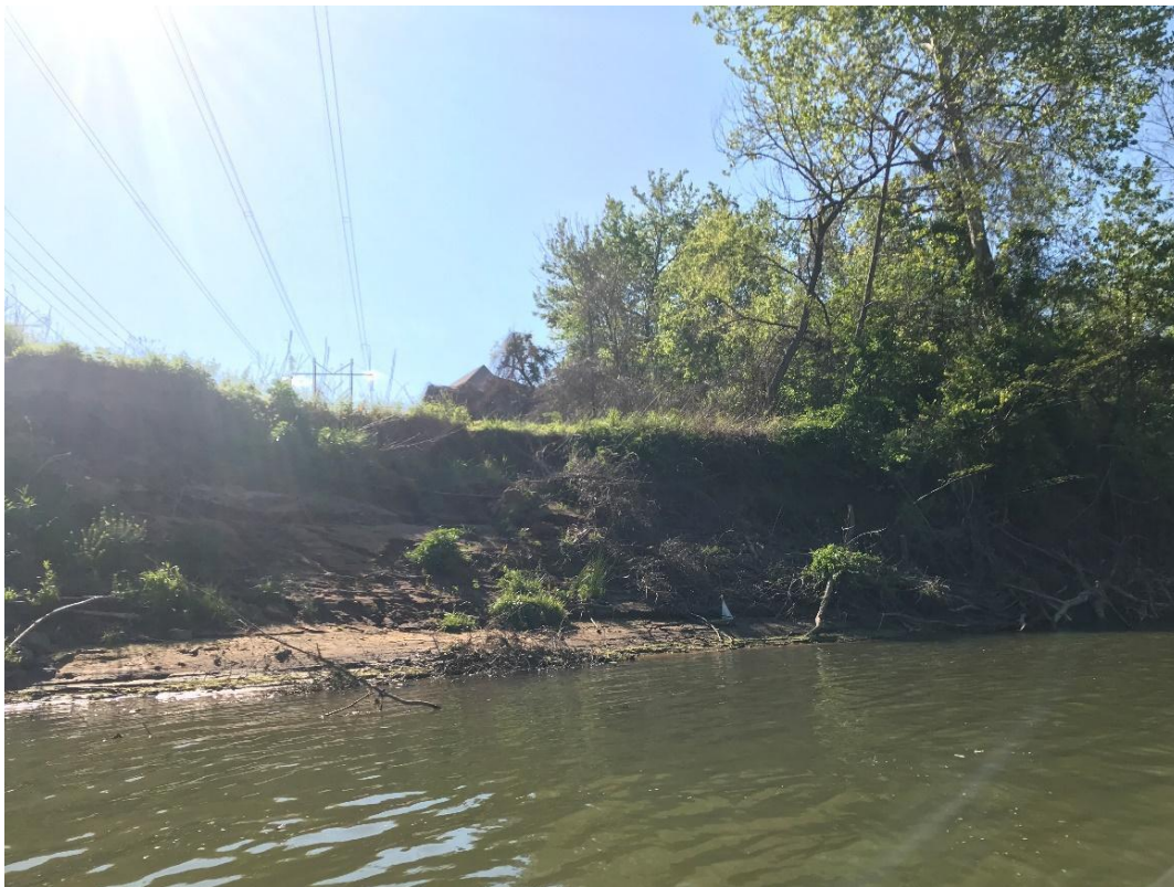
Figure 2: Bank erosion observed directly across from Darden Towe boat ramp.