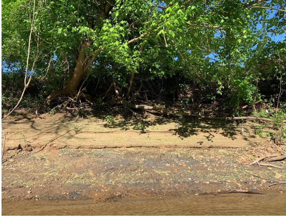
Figure 1: Looking closely, you can see white flags which indicate where RCA staff planted livestakes in winter 2019. Many stakes are now “leafing out,” signifying that they have successfully rooted and are creating more stable banks.